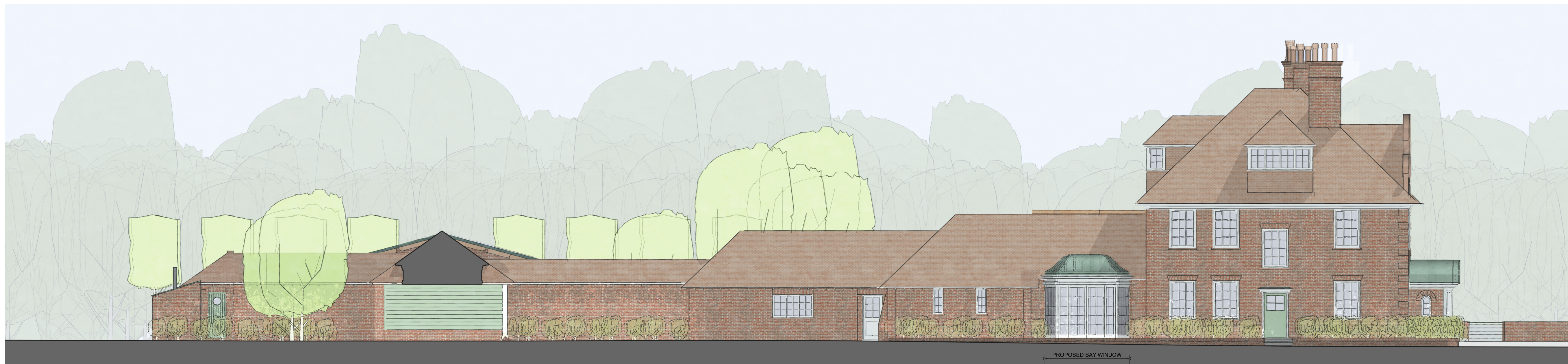
02 NORTH ELEVATION - PROPOSED BAY WINDOW 1:100