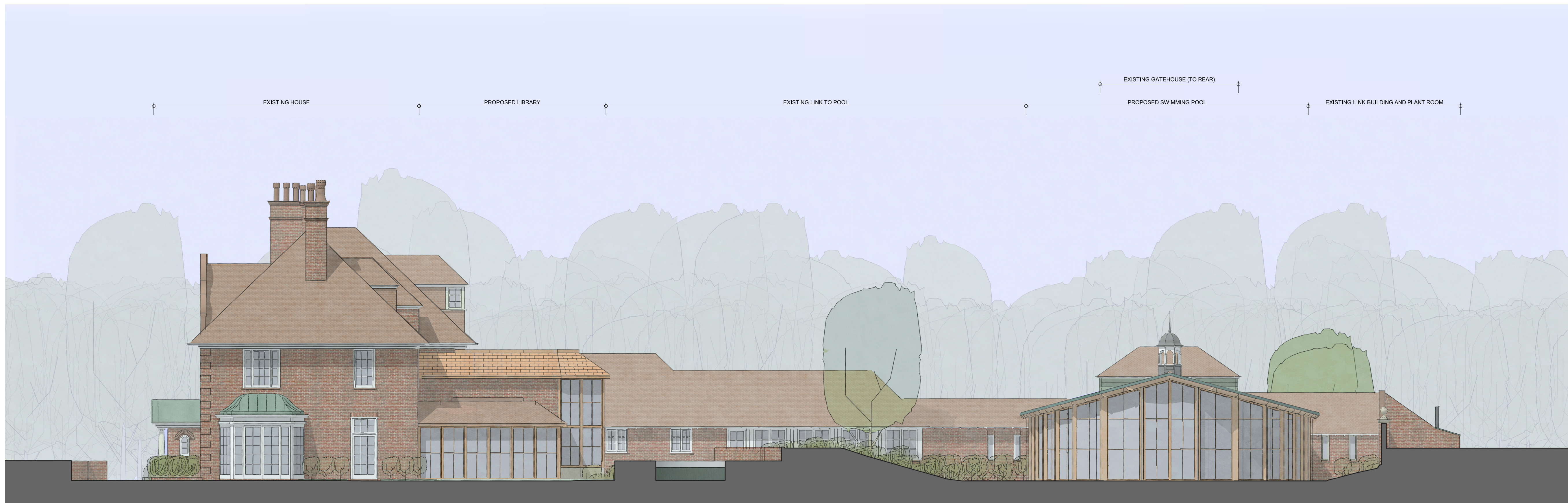
01 SOUTH ELEVATION - PROPOSED POOL AND LIBRARY 1:100