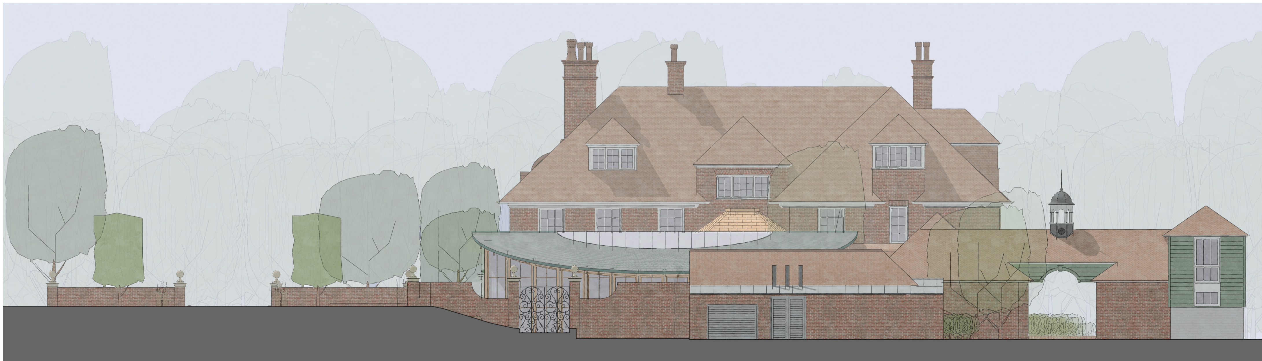
03 EAST ELEVATION - COURTYARD 1:100