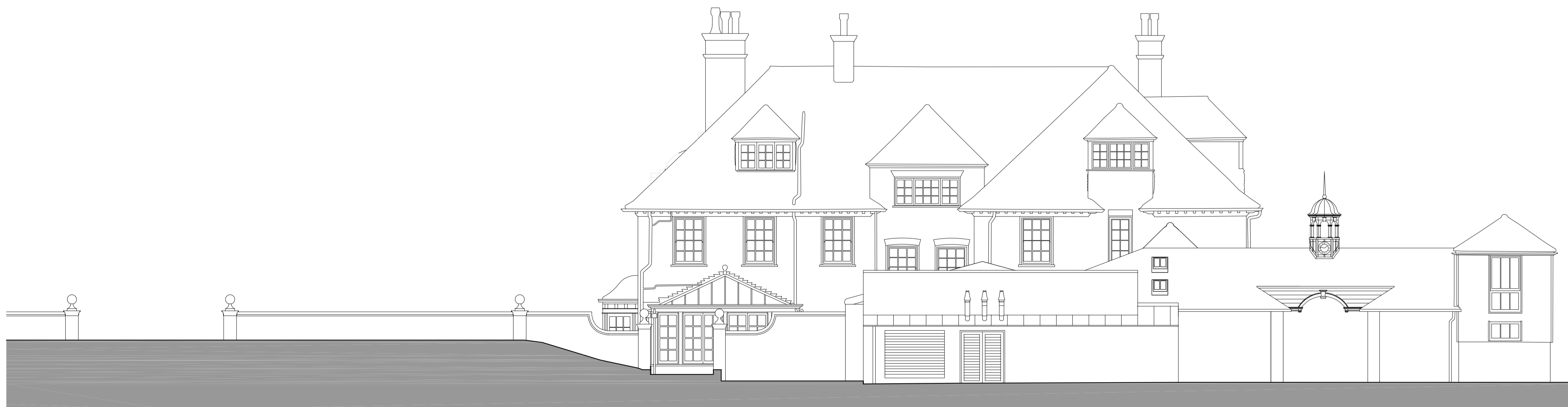
03 EAST ELEVATION - EXISTING COURTYARD 1:100