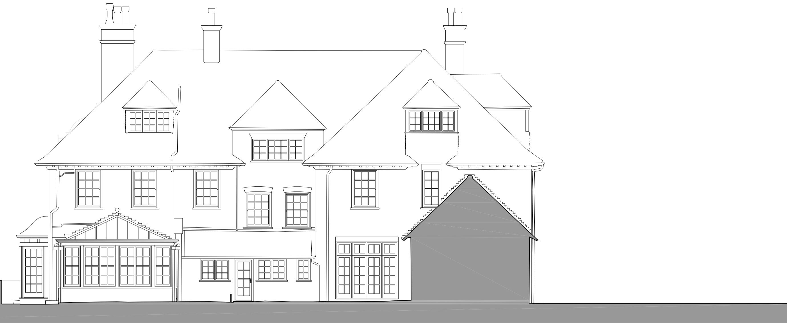
01 EAST ELEVATION - EXISTING HOUSE 1:100