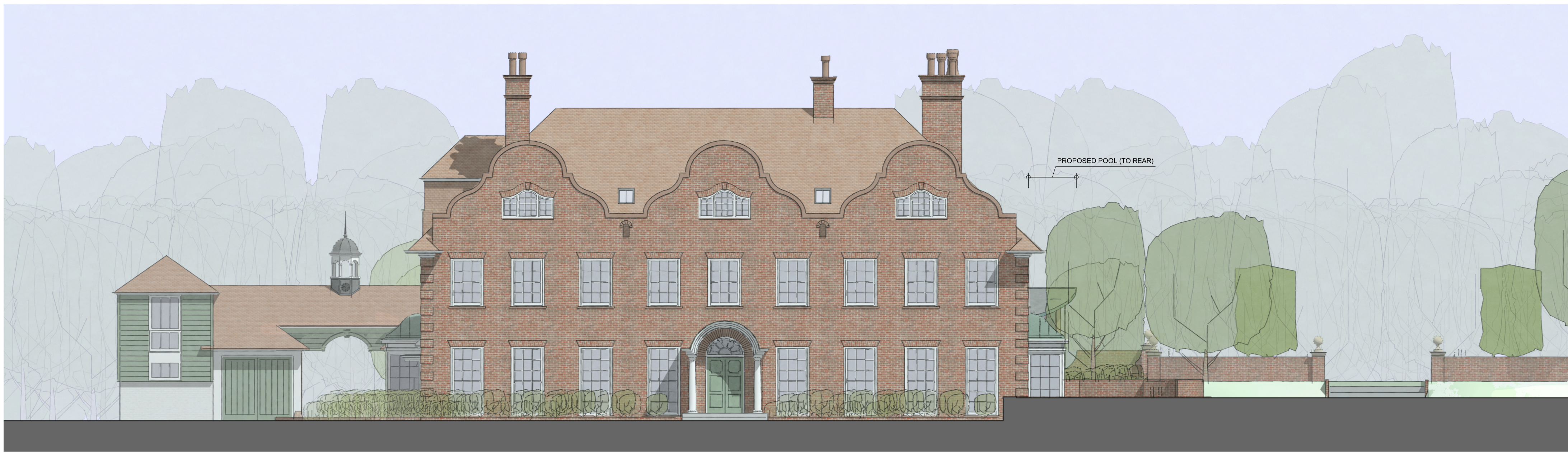
01 WEST ELEVATION - HOUSE WITH PROPOSED POOL TO REAR 1:100