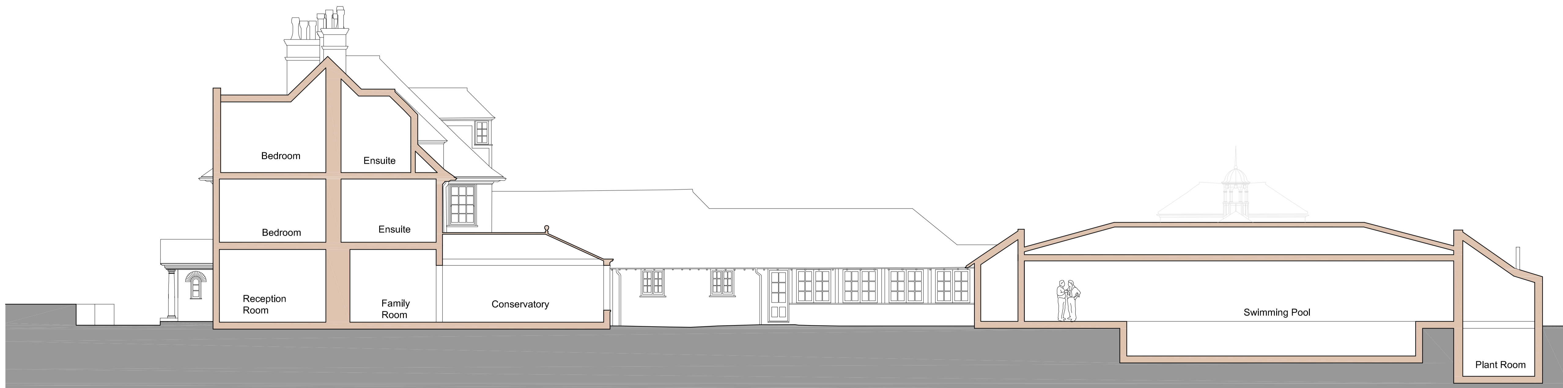
02 EXISTING SECTION A-A 1:100