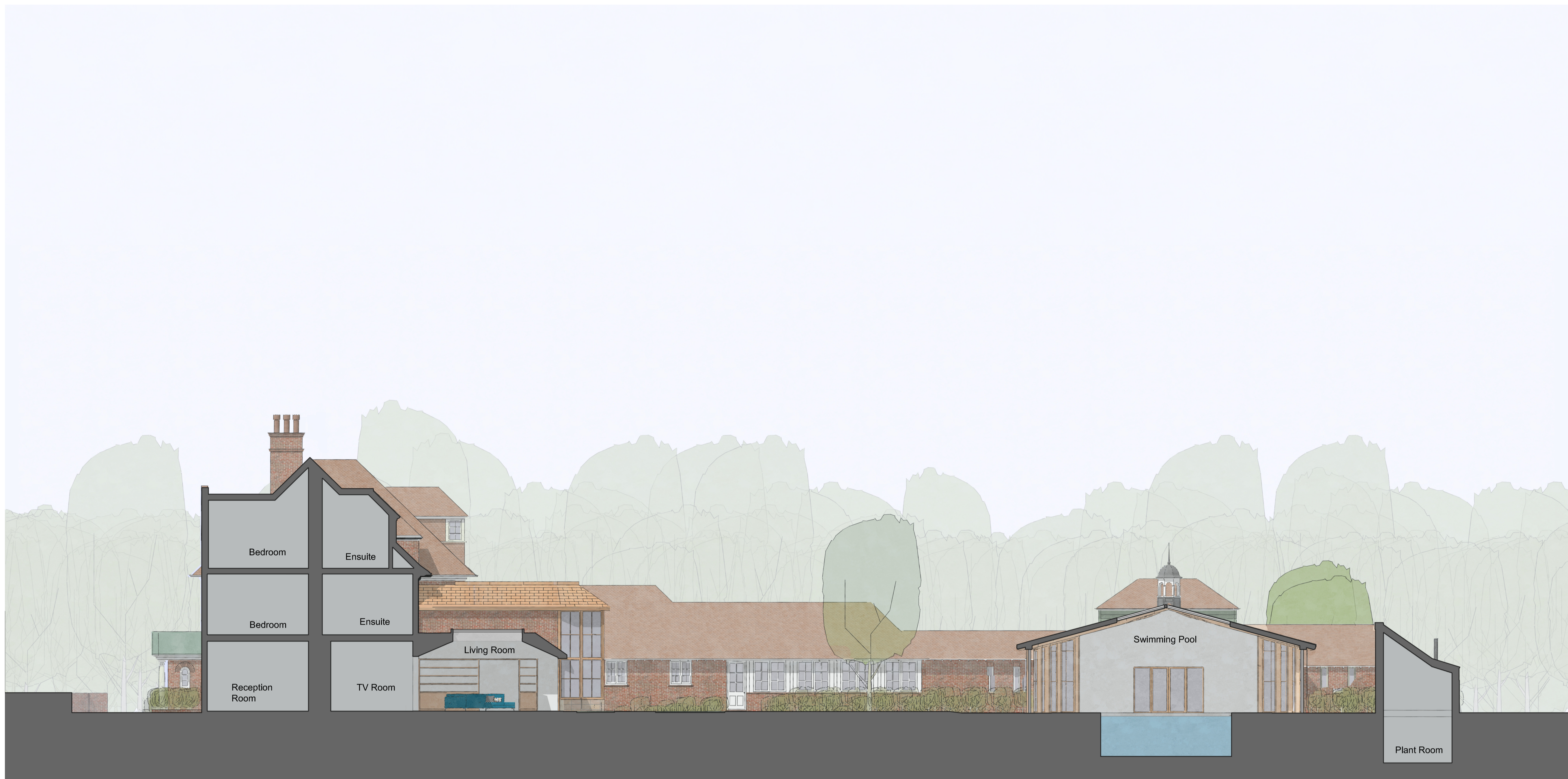
01 PROPOSED SECTION A-A 1:100