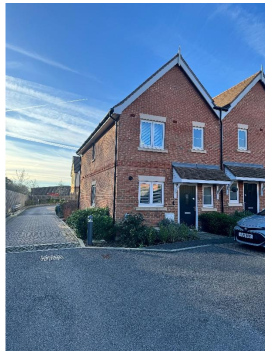
STREET VIEWS OF 2 ALBERTA CLOSE