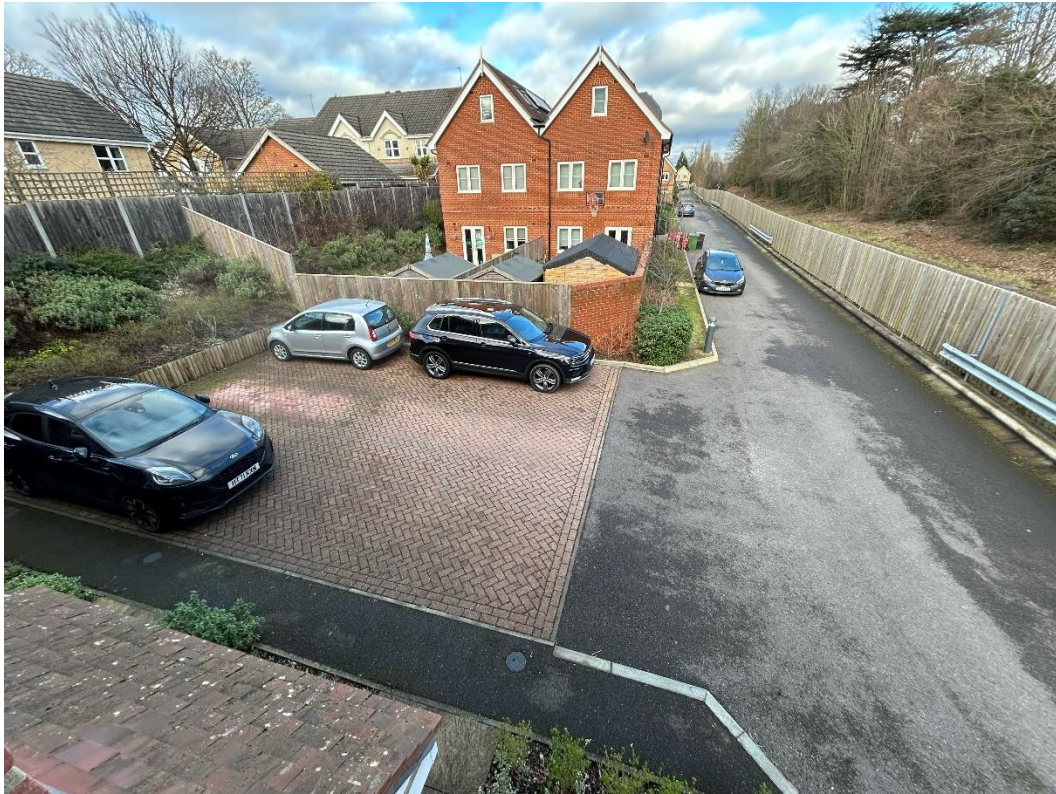
PARKING BAY VIEW OF 2 ALBERTA CLOSE