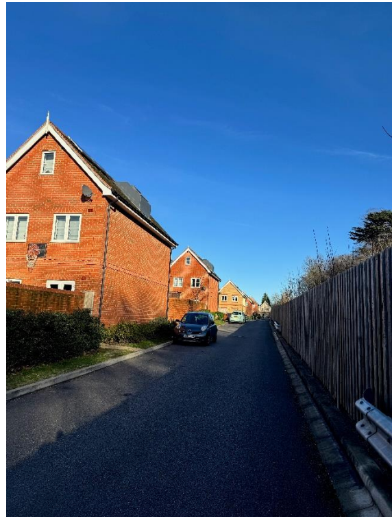
STREET VIEWS OF 2 ALBERTA CLOSE