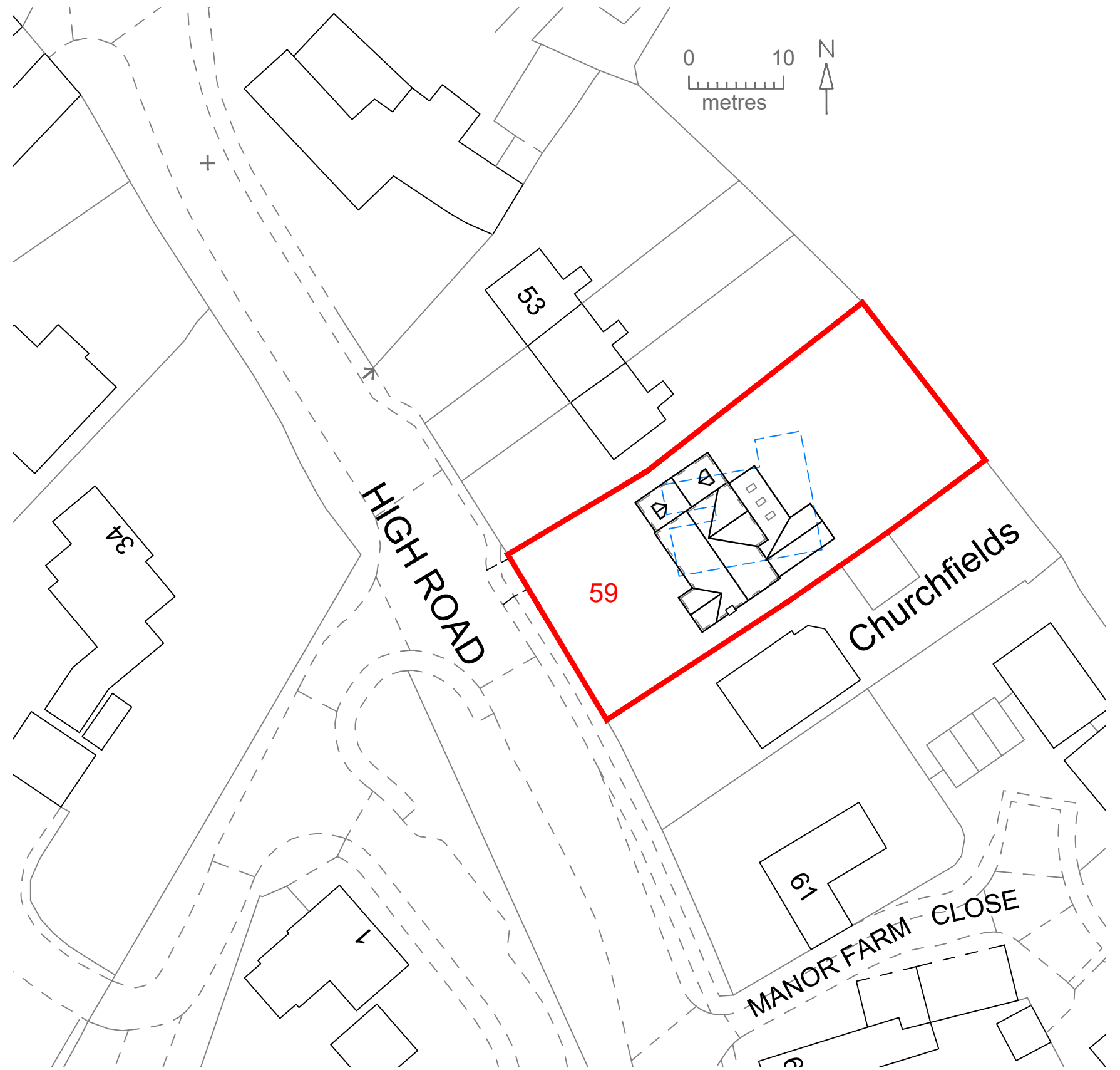
Block Plan As Proposed 1:500