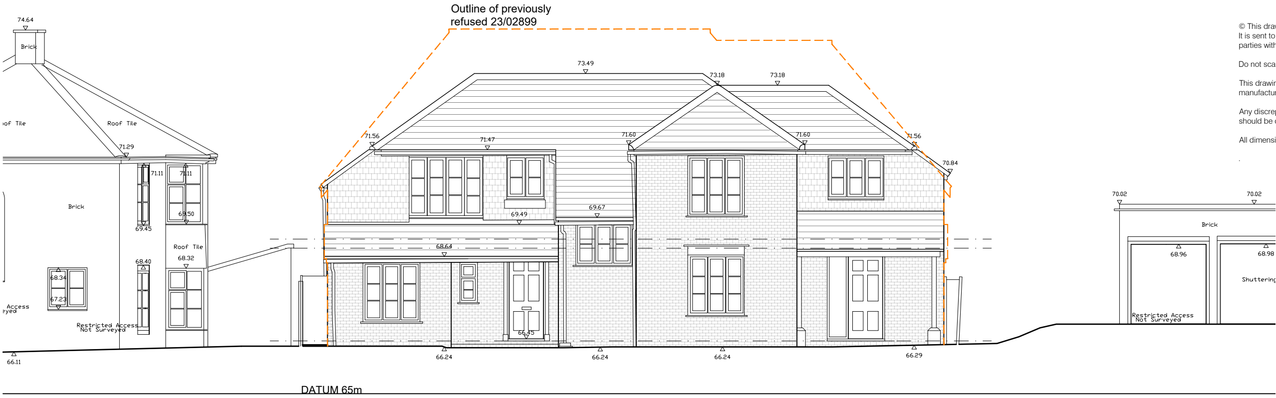
Proposed Front Elevation (West)