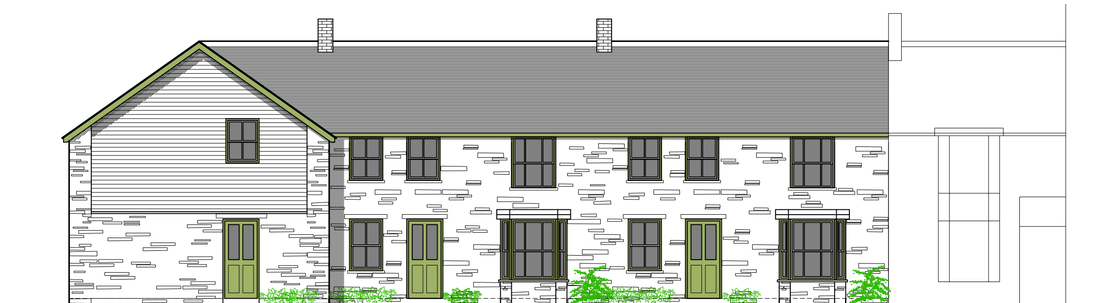
DRYCHIAD DWYRAIN / EAST ELEVATION