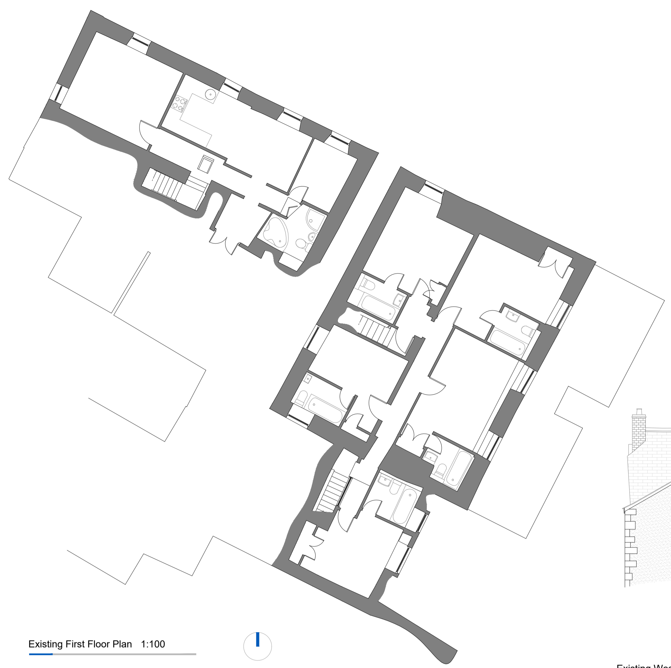
Existing First Floor Plan 1:100