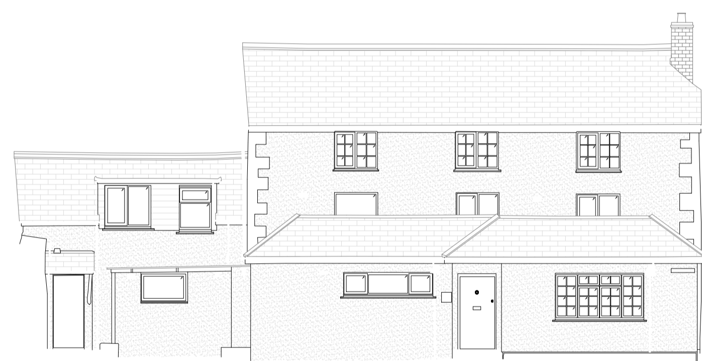
Existing East Elevation 1:100