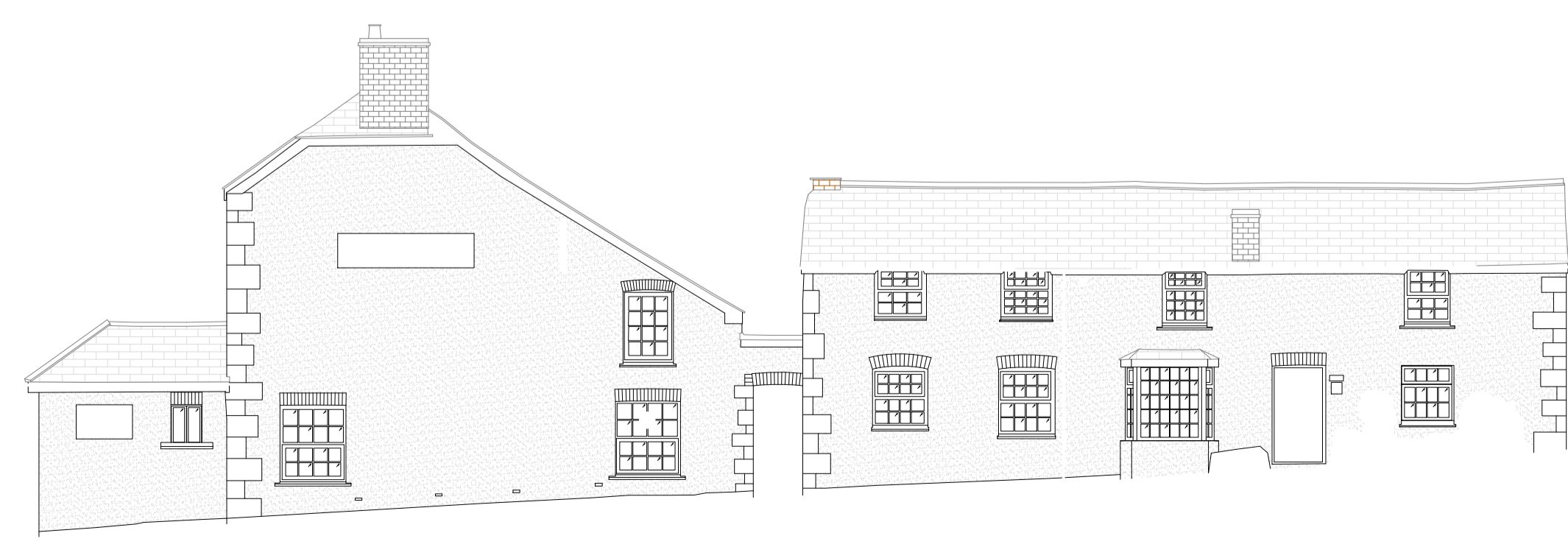
Existing North Elevation 1:100