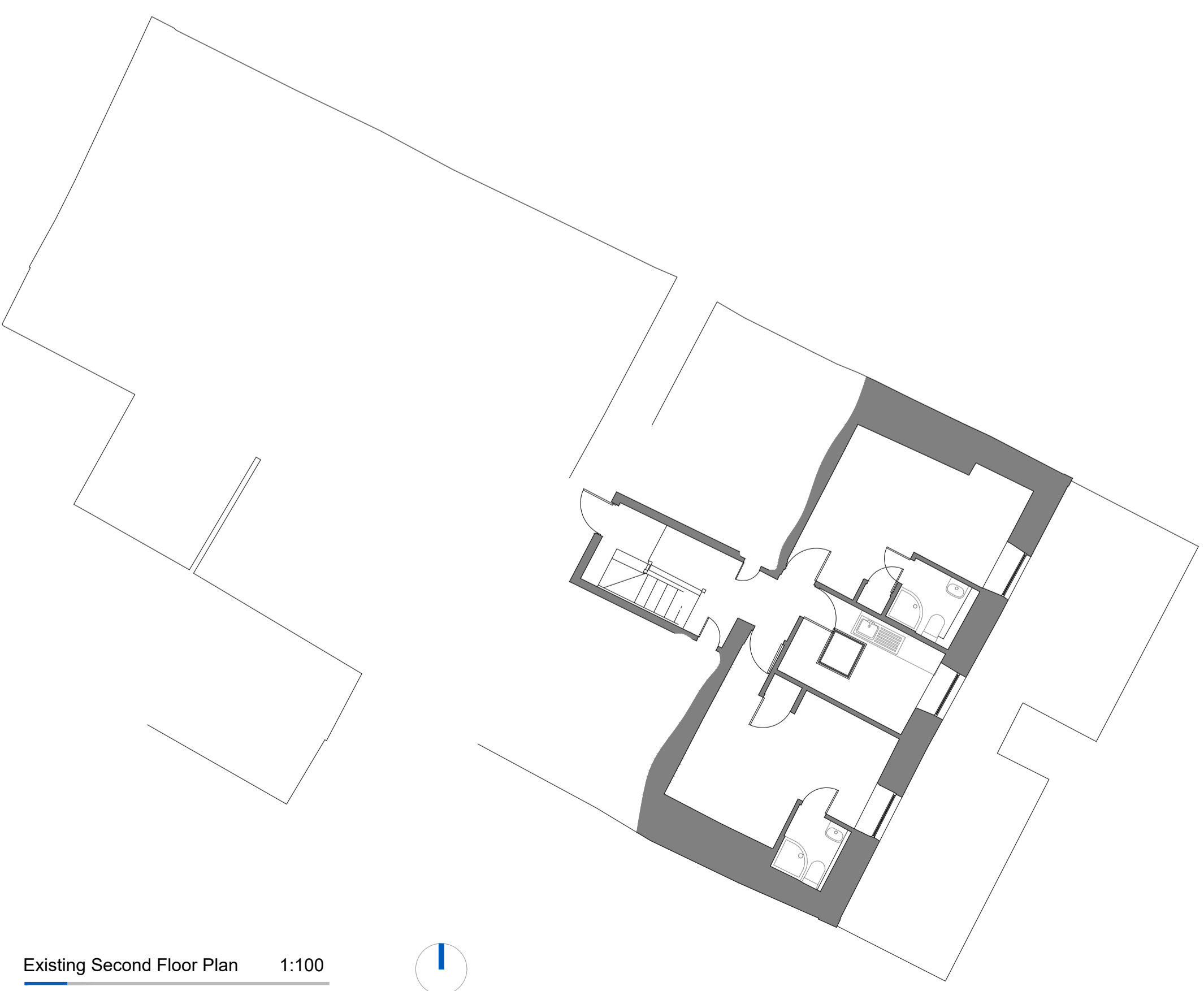
Existing Second Floor Plan 1:100