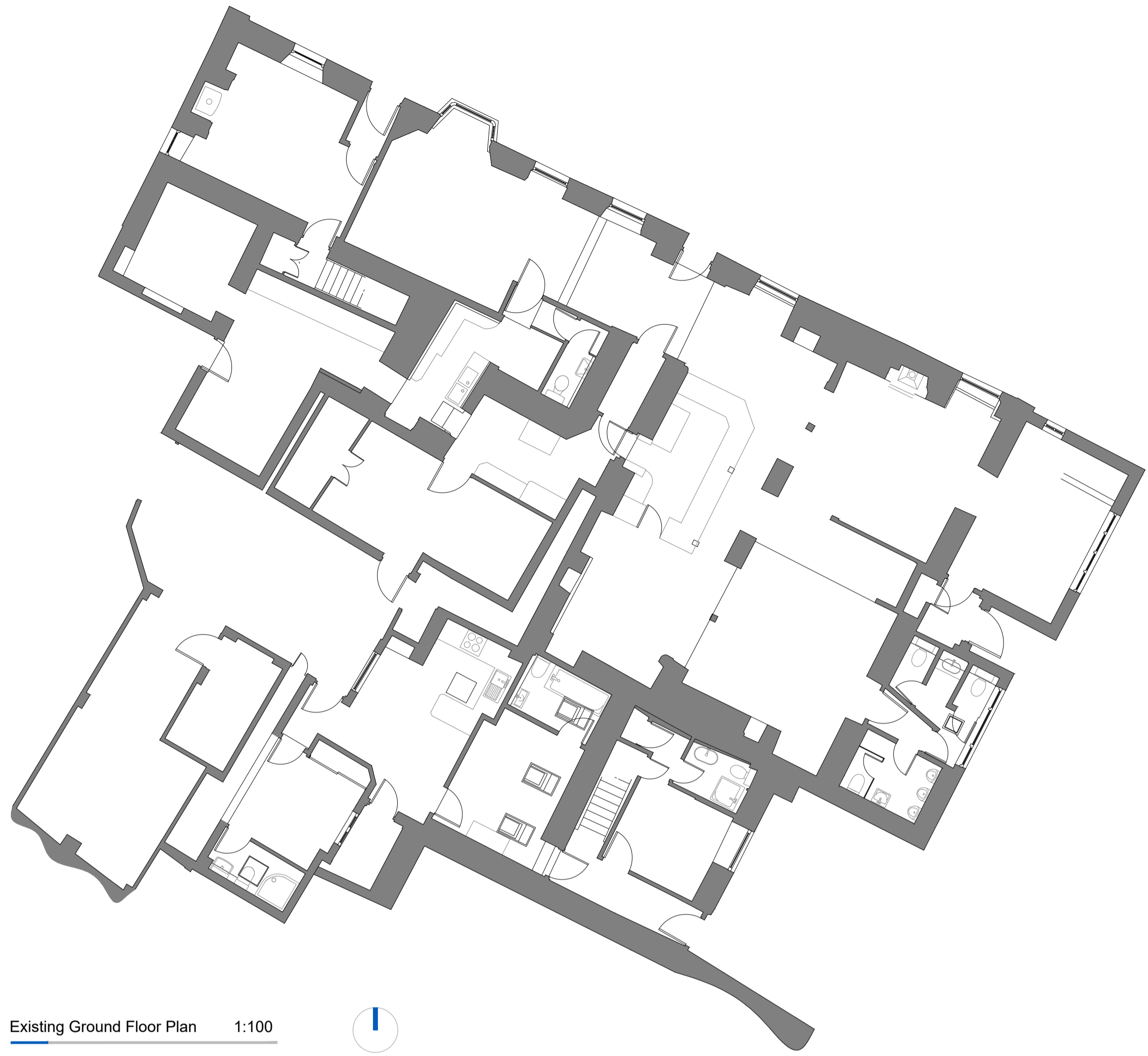
Existing Ground Floor Plan 1:100