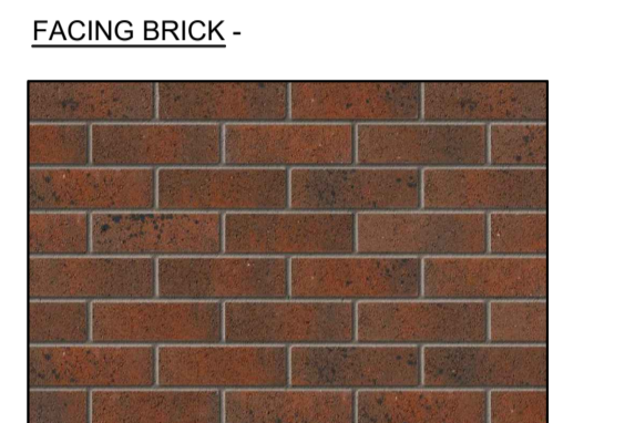
Marshalls - Winterbourne Berry