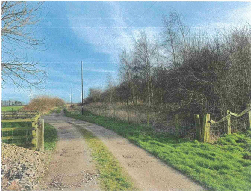
Plate 1 – North Western corner of Forest facing East along farm track