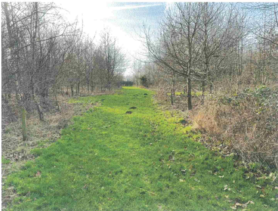
Plate 4 – Existing forest grass track

P & ER DEVELOPMENT CONTROL REC'D 12 FEB 2024 CHEQUE ENCLOSED