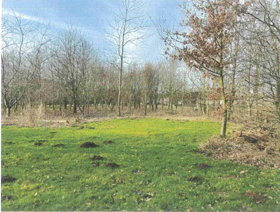
Plate 5 – Proposed location of 2 no Containers