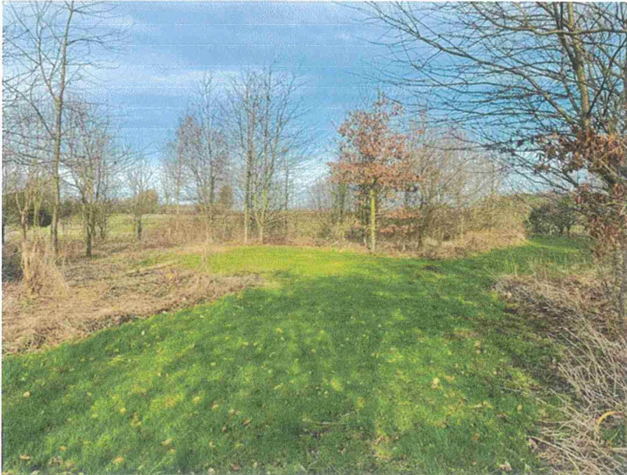
Plate 6 – Proposed extent of existing grass track improvement.

P & ER DEVELOPMENT CONTROL REC'D 12 FEB 2024 CHEQUE ENCLOSED