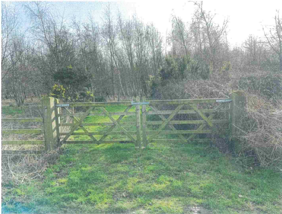
Plate 3 – Gated entrance and existing forest grass track.