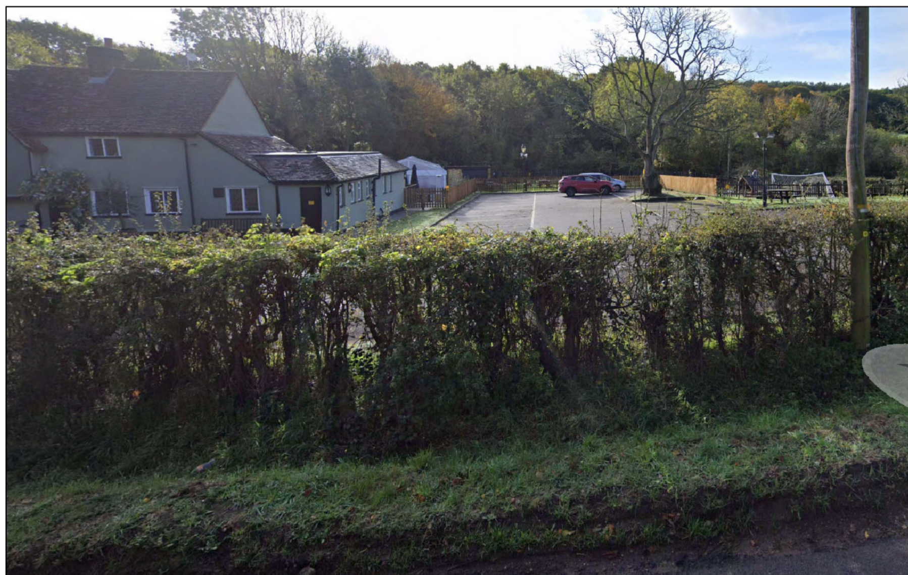
D VIEW NTS