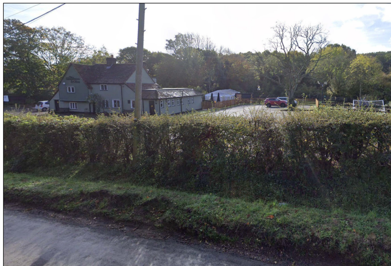
E VIEW SCALE 1:100

Notes: Contractors are to check dimensions and levels of all issued drawings and are to notify the architect immediately of any discrepancy