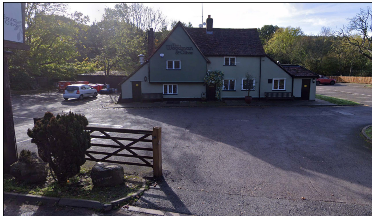
C VIEW NTS