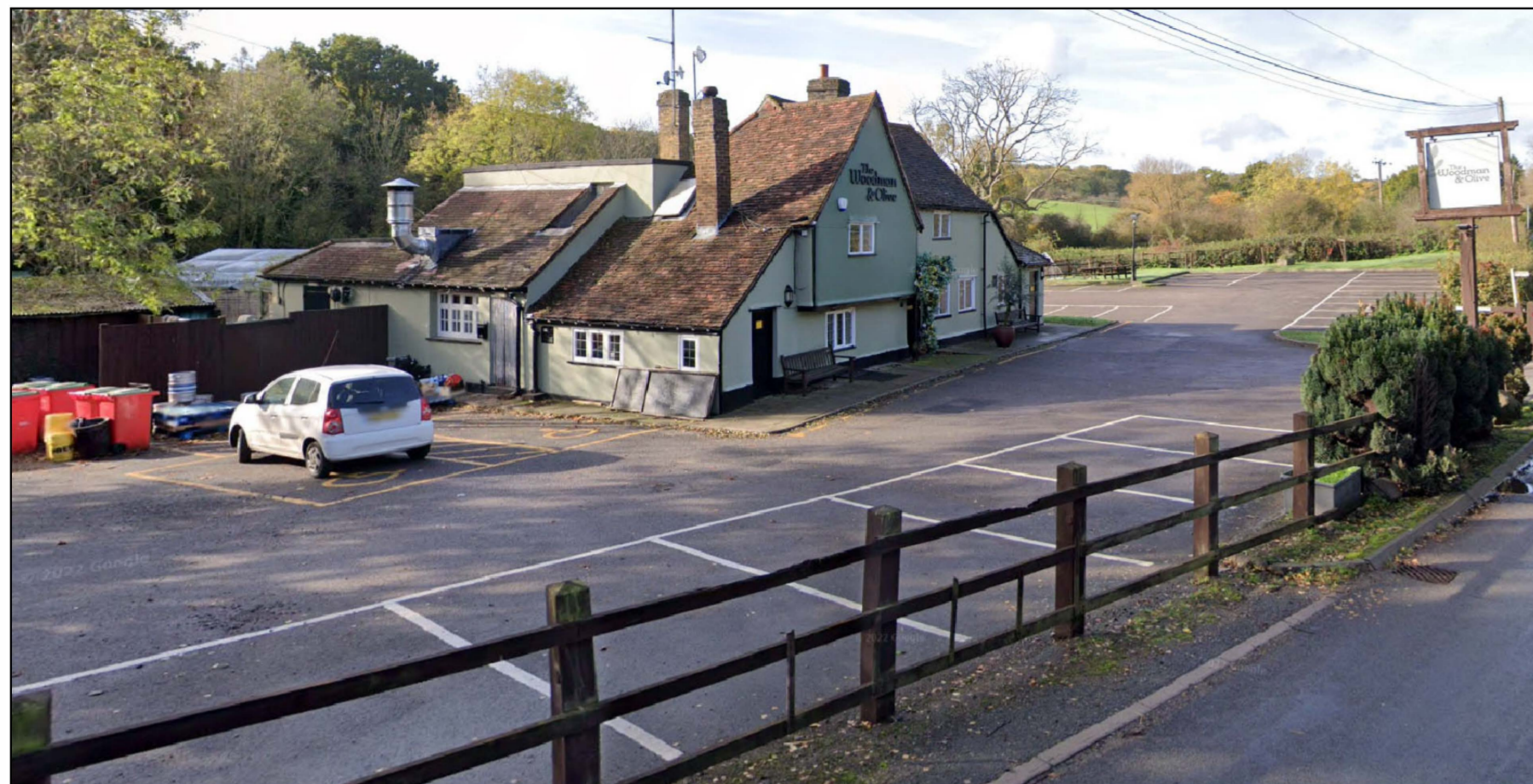
A VIEW NTS