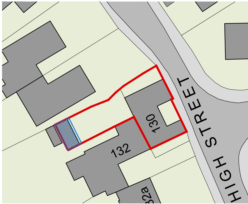
[02] EXISTING BLOCK PLAN 1:500

the contractors are to check all dimensions, drain runs and general conditions on the site before works commence, and inform ARGENTO DESIGN STUDIO immediately upon discovery of any errors, omissions or discrepancies. all works are to be carried out in accordance with current building regulations, british standards, code of practice and local authority requirements. this drawing must be read together with the specification, bill of quantities and related drawings.