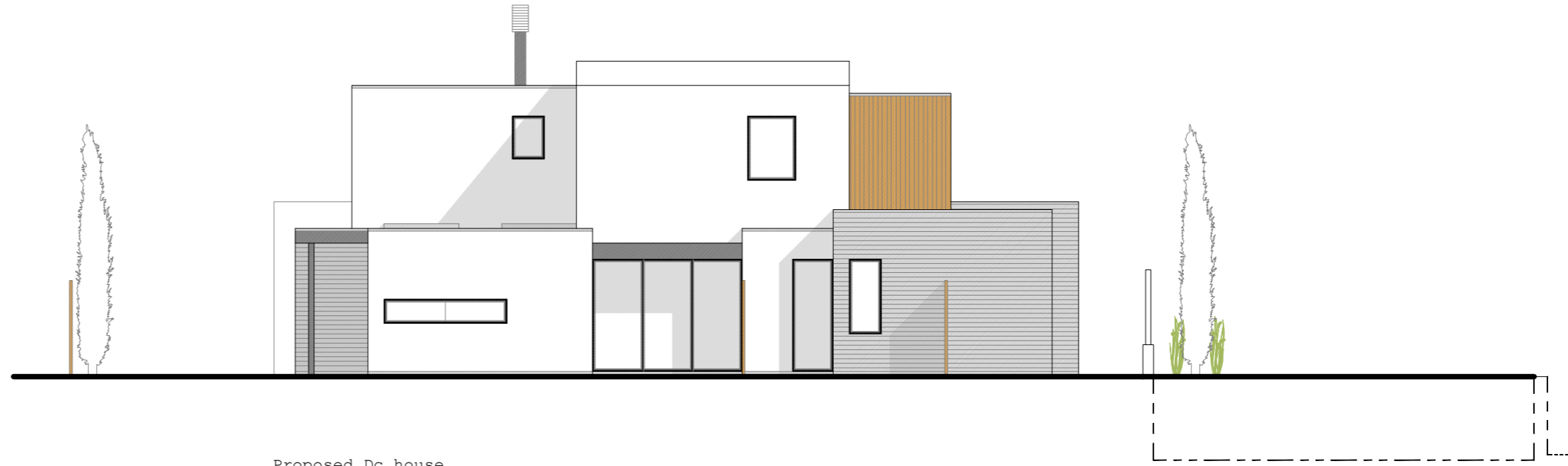
Proposed Dc house North West Elevation (Left side) Scale 1:100