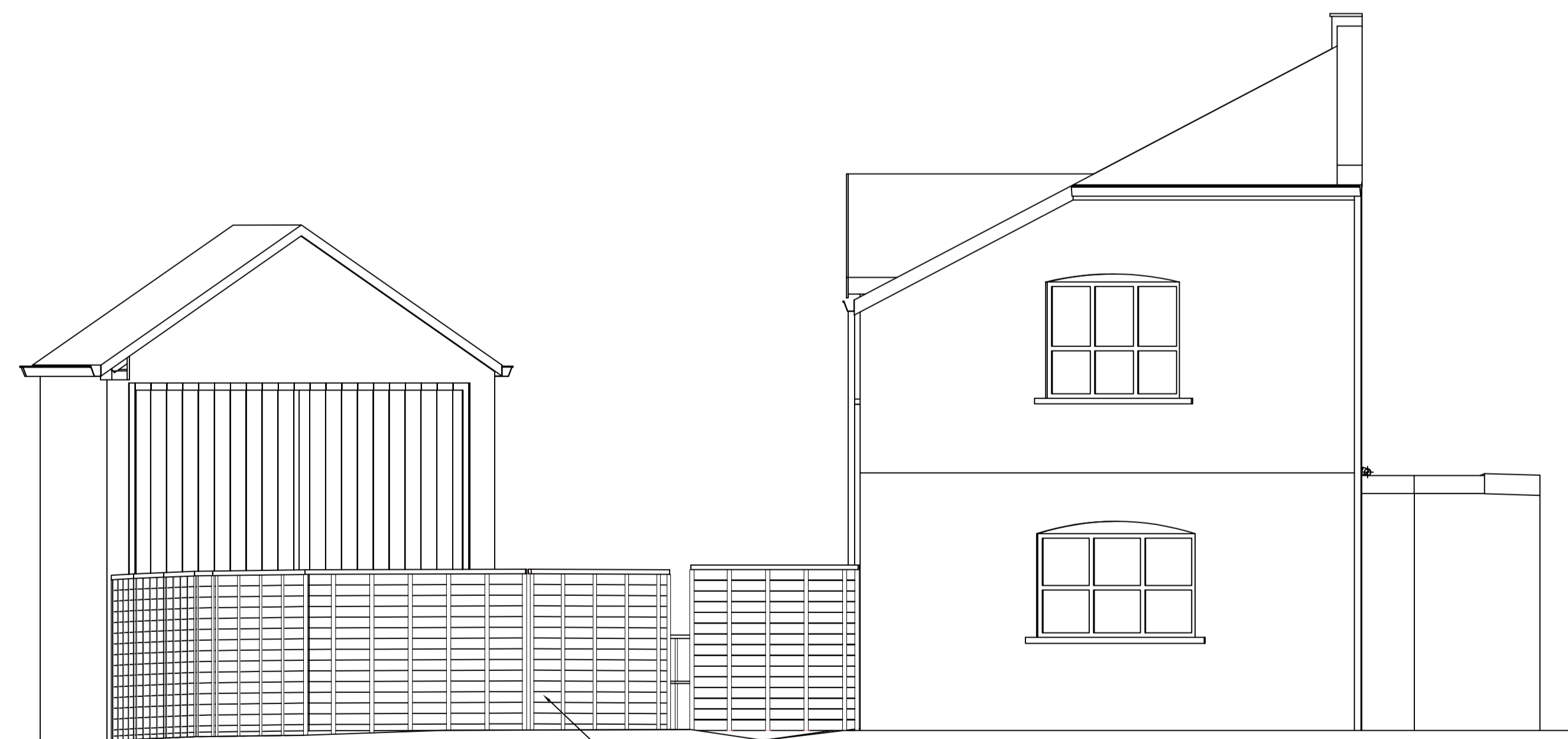
Existing side (north west) elevation to street

Please note: the proposed extension shown above is yet to be built and has been approved under S.23/1245/HHOLD