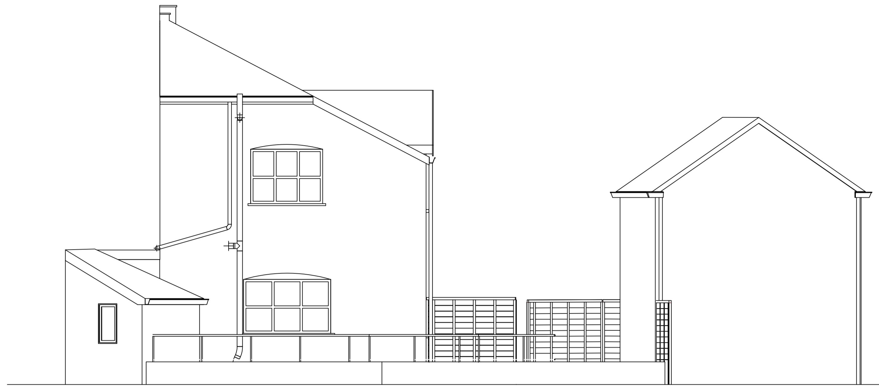
Existing side (south east) elevation