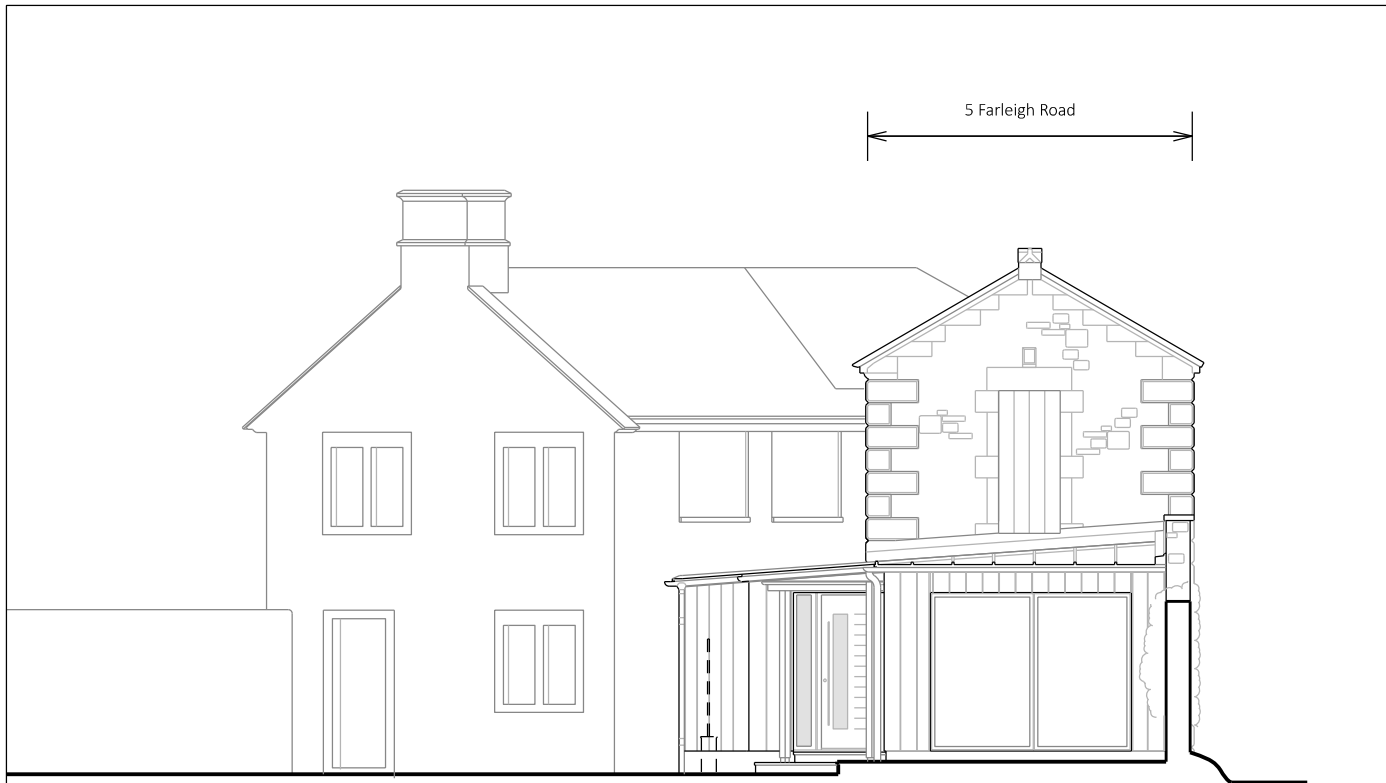
Gable - North - elevation