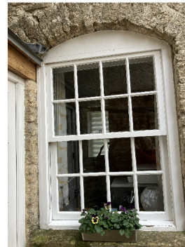
WG.01 sill and outer lining to frame show signs of rot

To be fitted with new magnetically fixed secondary glazing and draught strip, see detail drawing 72-D-12