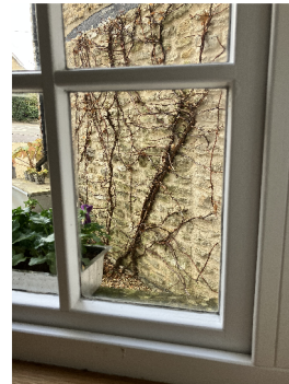
WG.01 internal frame and glazing bar detail (WG.03 matches)