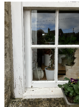
WG.03 sill and outer lining to frame show signs of rot

PROJECT 5 Farleigh Road, Norton St Philip