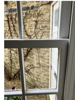
WG.01 internal frame and meeting rail detail (WG.03 matches)