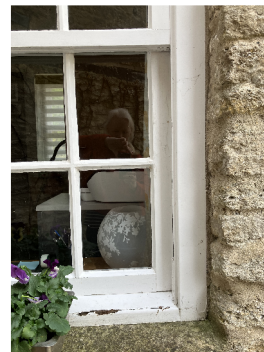
WG.01 sill and outer lining to frame show signs of rot