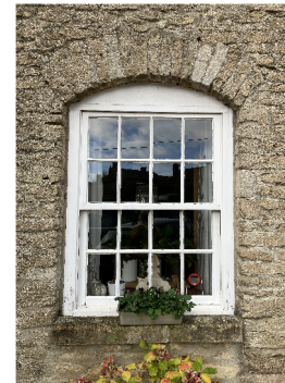
WG.03 sill and outer lining to frame show signs of rot