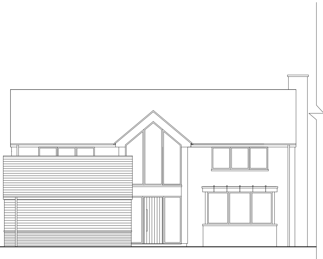
Plot 2 – Front Elevation