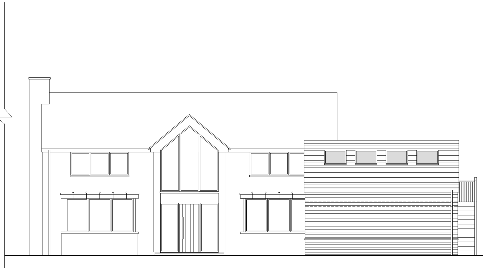
Plot 1 – Front Elevation