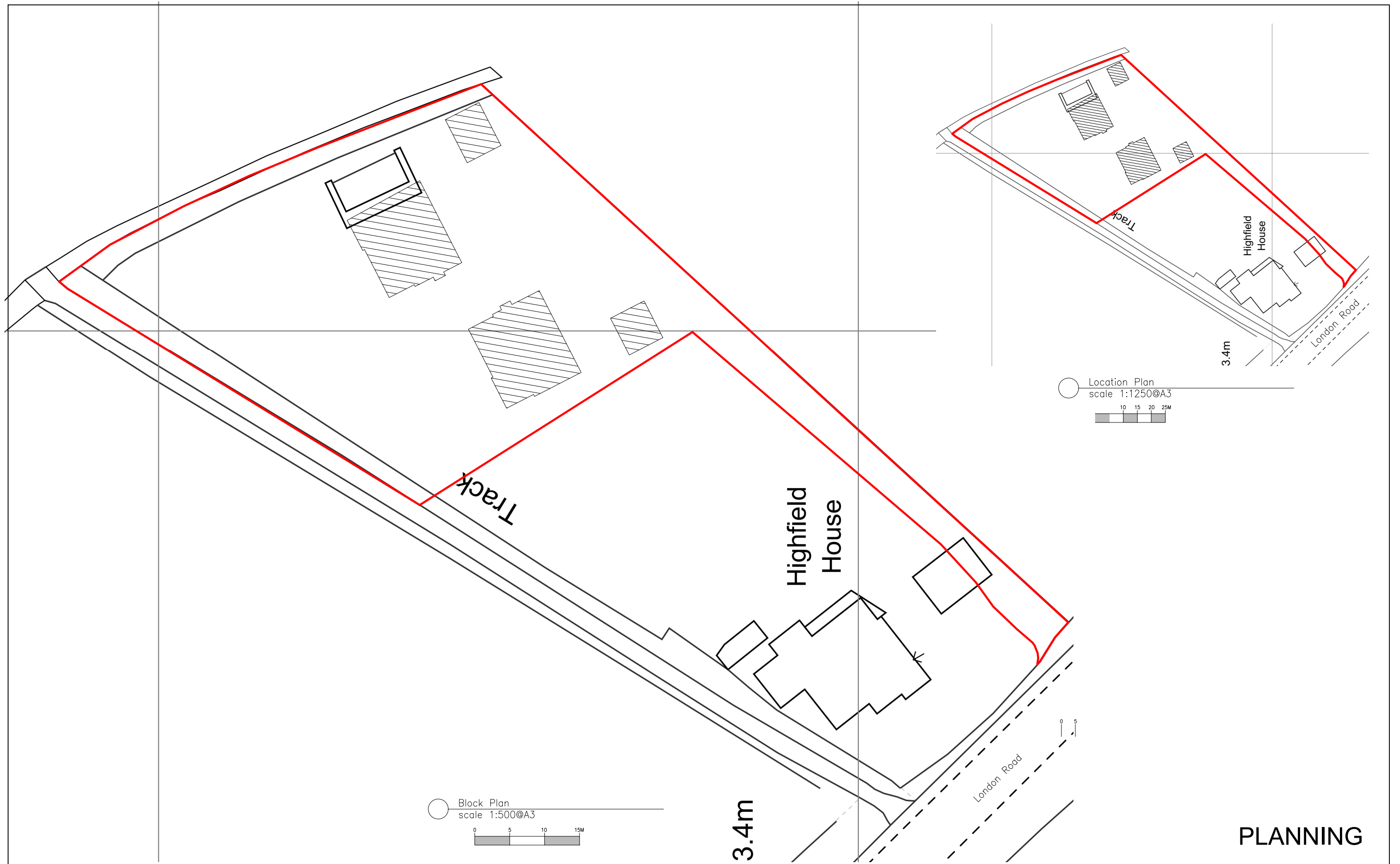
Block Plan scale 1:500@A3