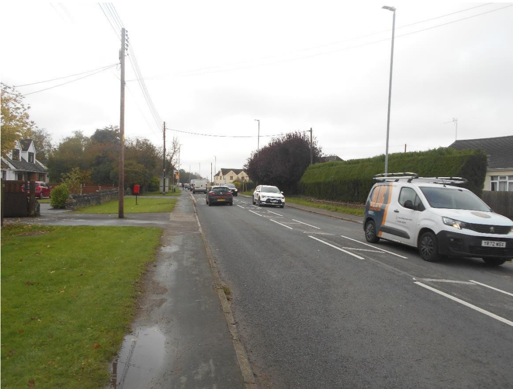
Looking south west on B4058. The proposed island will be just this side of the black car