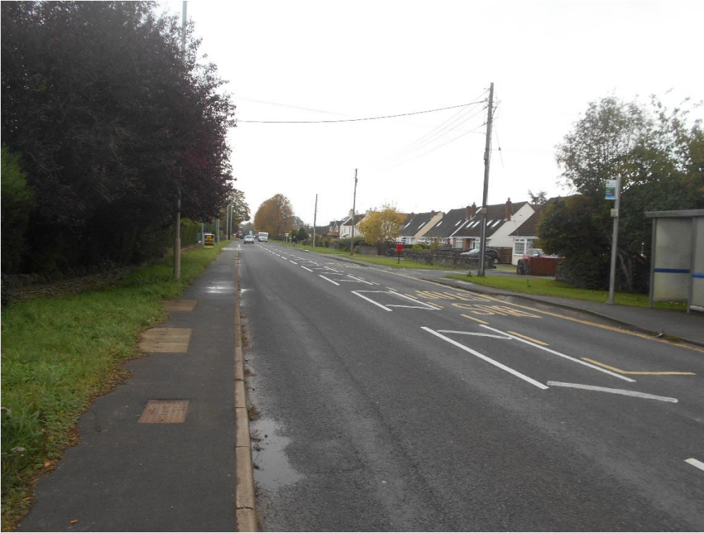
Looking north east on the B4058. The proposed island will be just past the red post box in centre of the photo. The existing hatching will be widened slightly to accommodate it