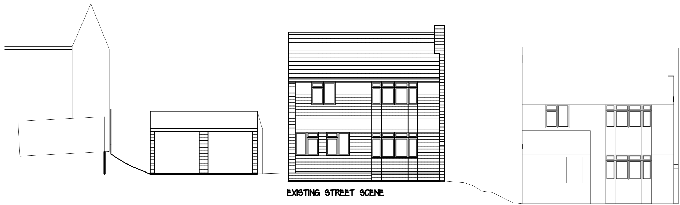
EXISTING STREET SCENE