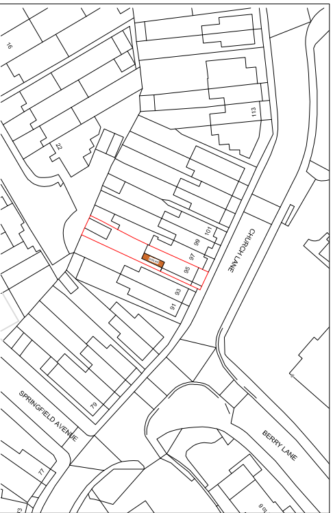
PROPOSED LOCATION PLAN 1:1250