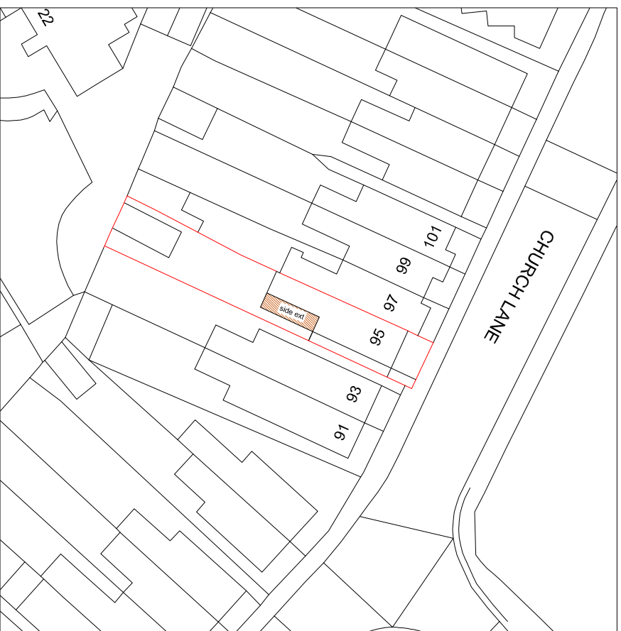
PROPOSED BLOCK PLAN 1:500