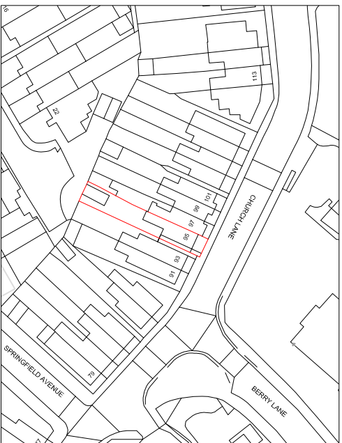
EXISTING LOCATION PLAN 1:1250