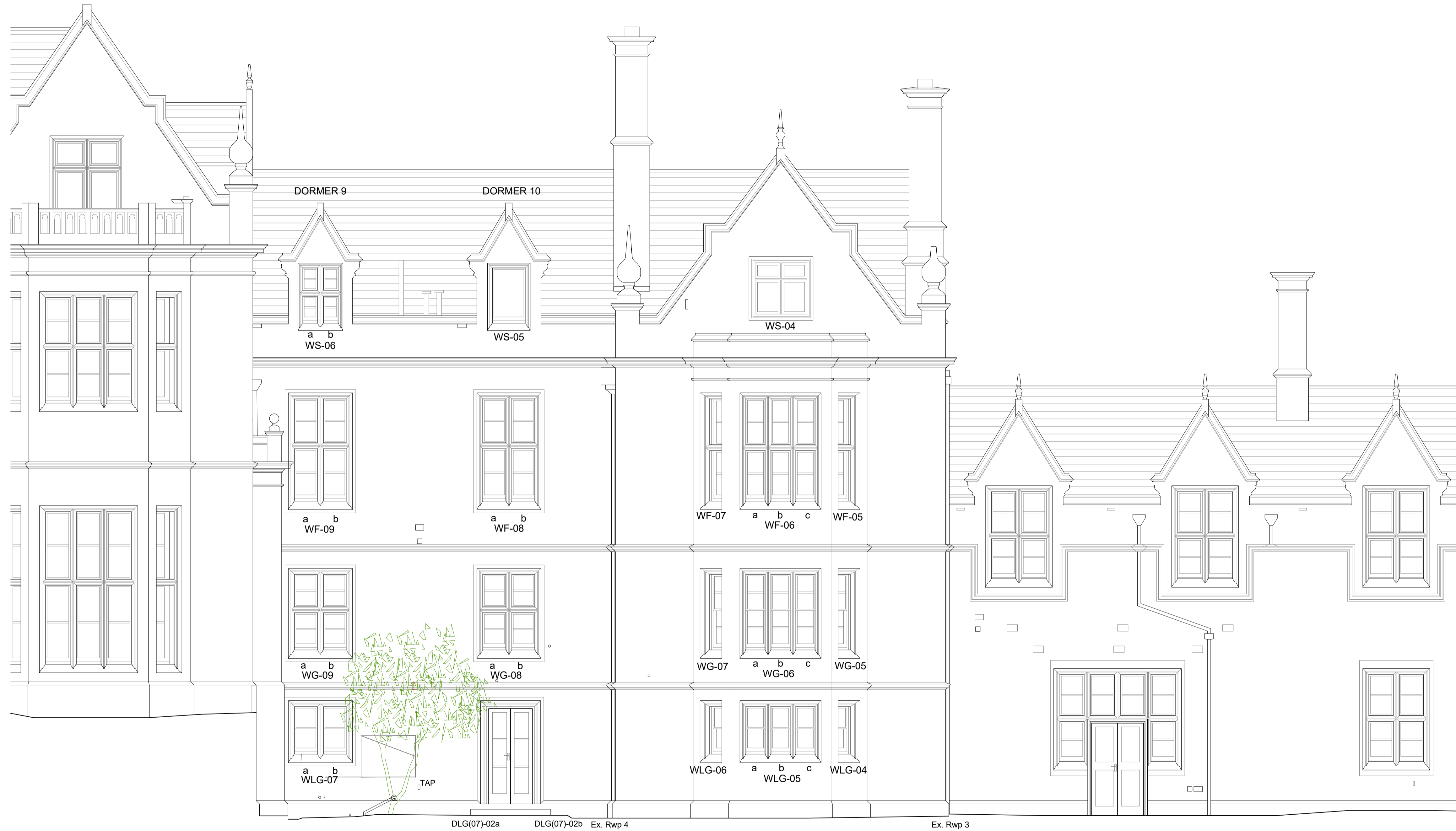
East Elevation (Main) as Existing Scale 1:50 @ A1

NOTE Do not scale from this drawing - all dimensions should be checked on site by the contractor prior to construction and discrepancies notified to the architect immediately. This drawing should be read in conjunction with the architect's drawings, specification and schedules, and those provided by the other consultants. For information on known hazards and general health & safety issues prior to work on site, reference should be made to the Pre-Construction Health & Safety Pack