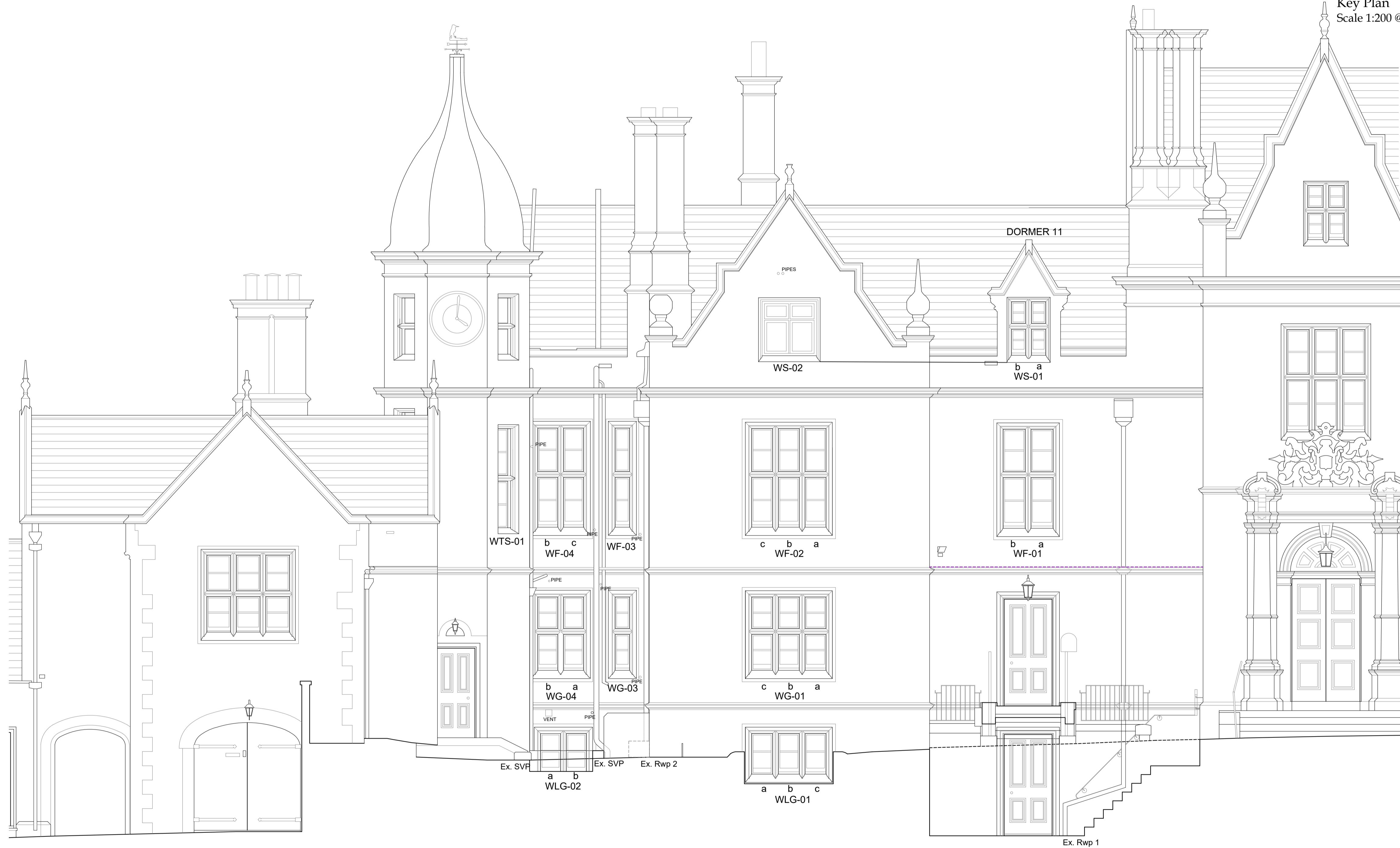
West Elevation as Existing Scale 1:50 @ A1