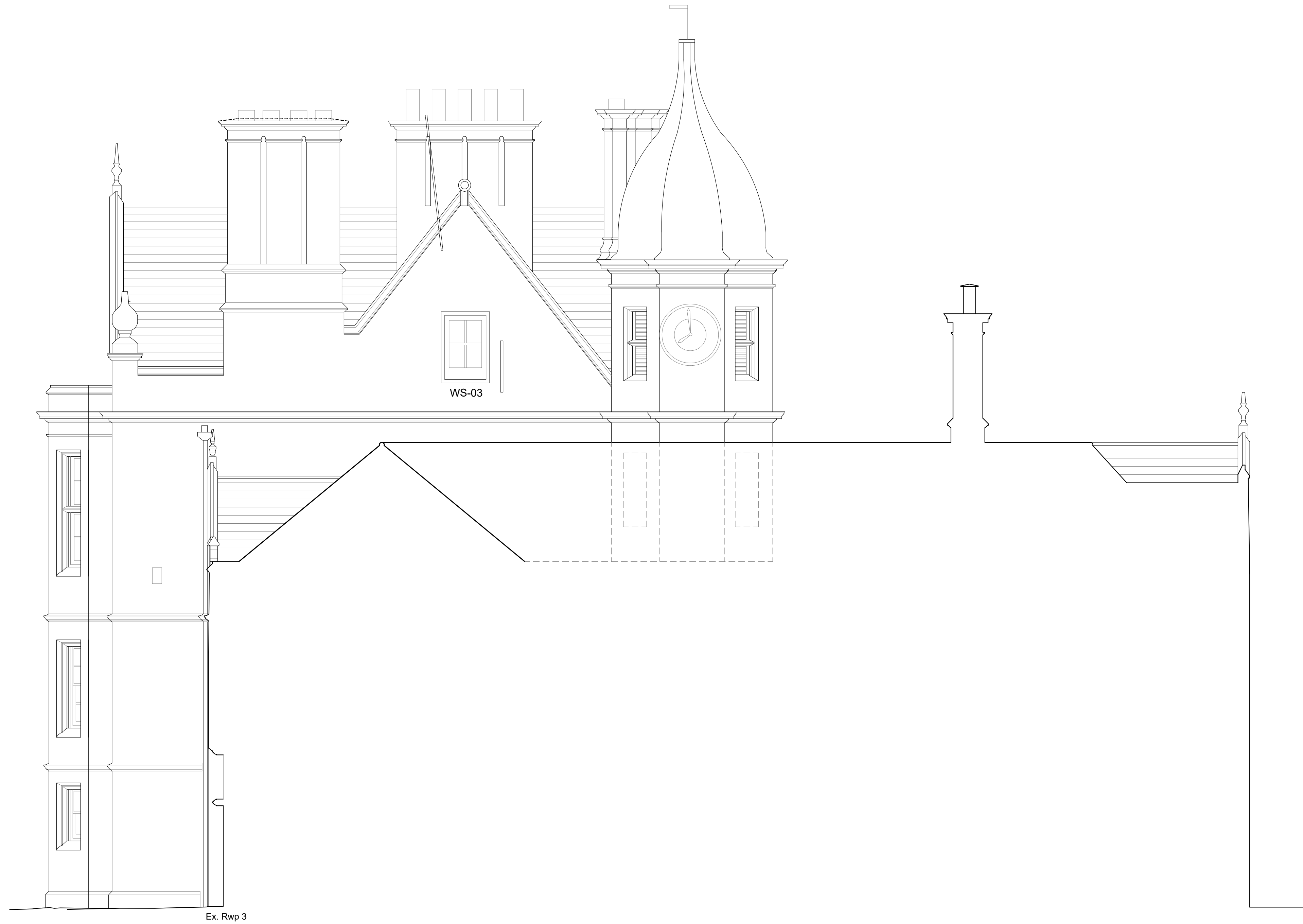
North Elevation (Main) as Existing Scale 1:50 @ A1

For information on known hazards and general health & safety issues prior to work on site, reference should be made to the Pre-Construction Health & Safety Pack