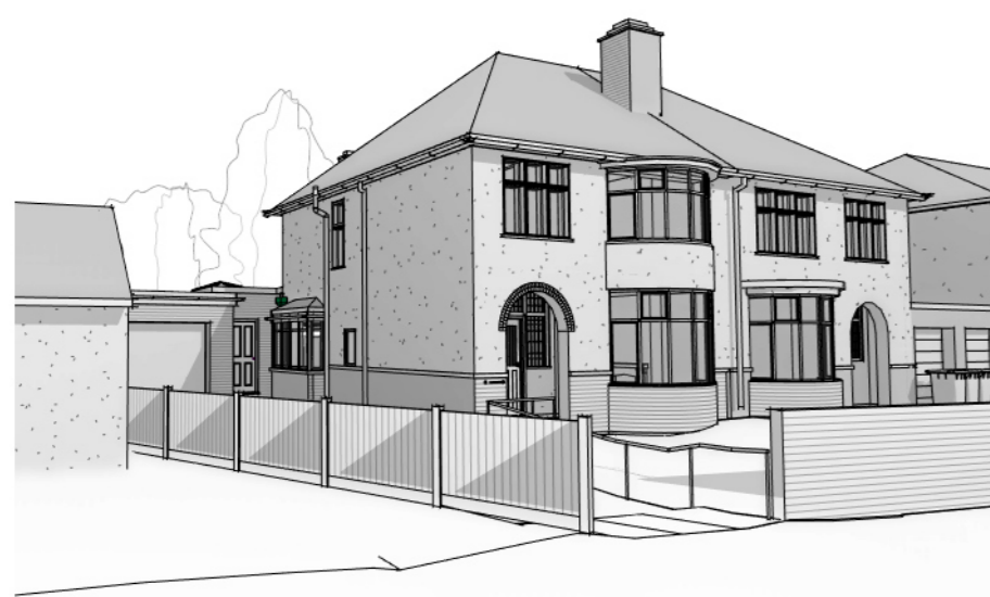
3 | Proposed Front View