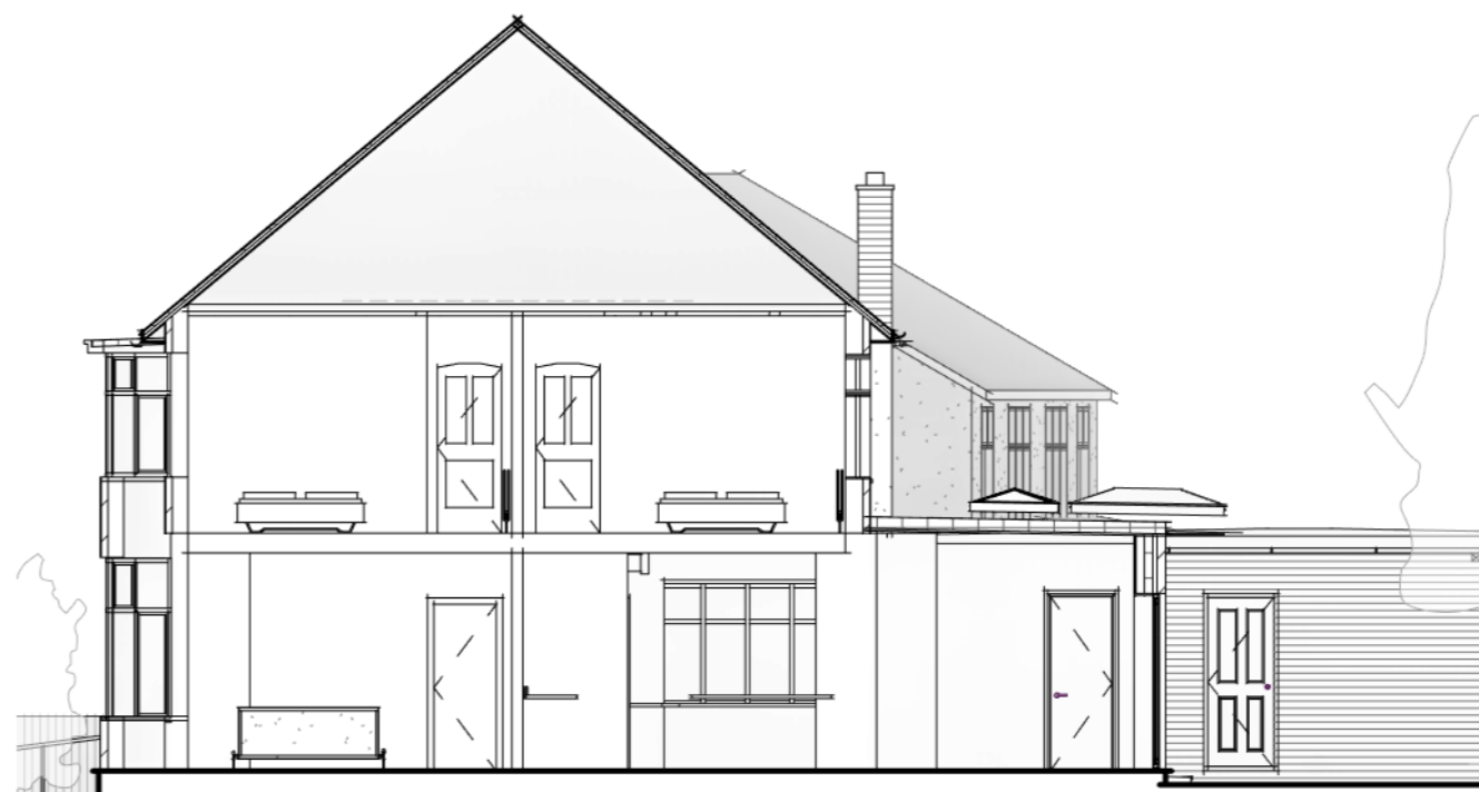
5 | Section 10