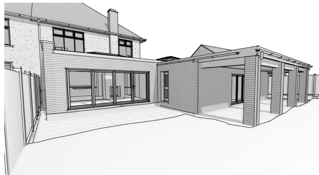
4 | Proposed Rear View