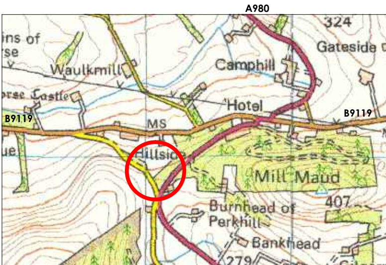
OS Map Scale 1:25,000