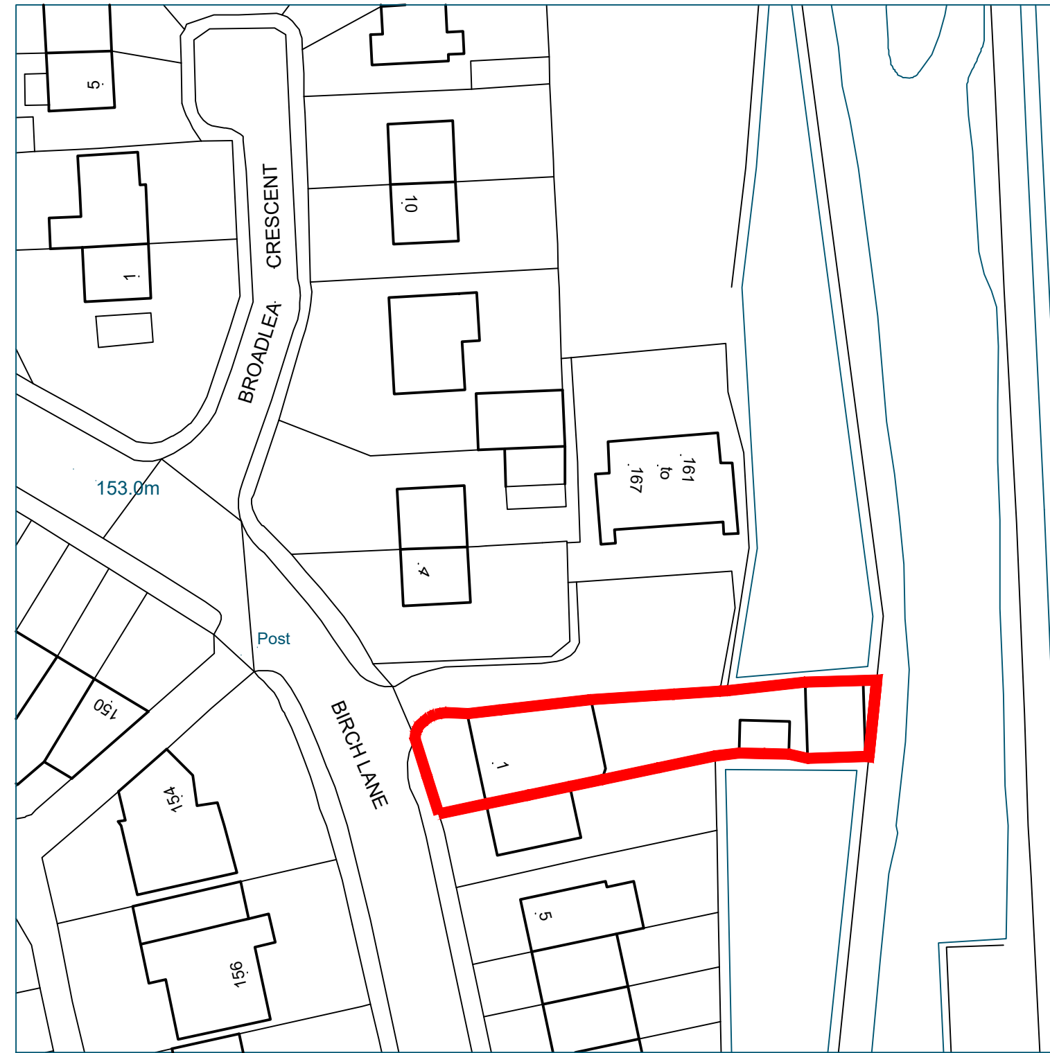
EXISTING SITE/BLOCK PLAN 1:500