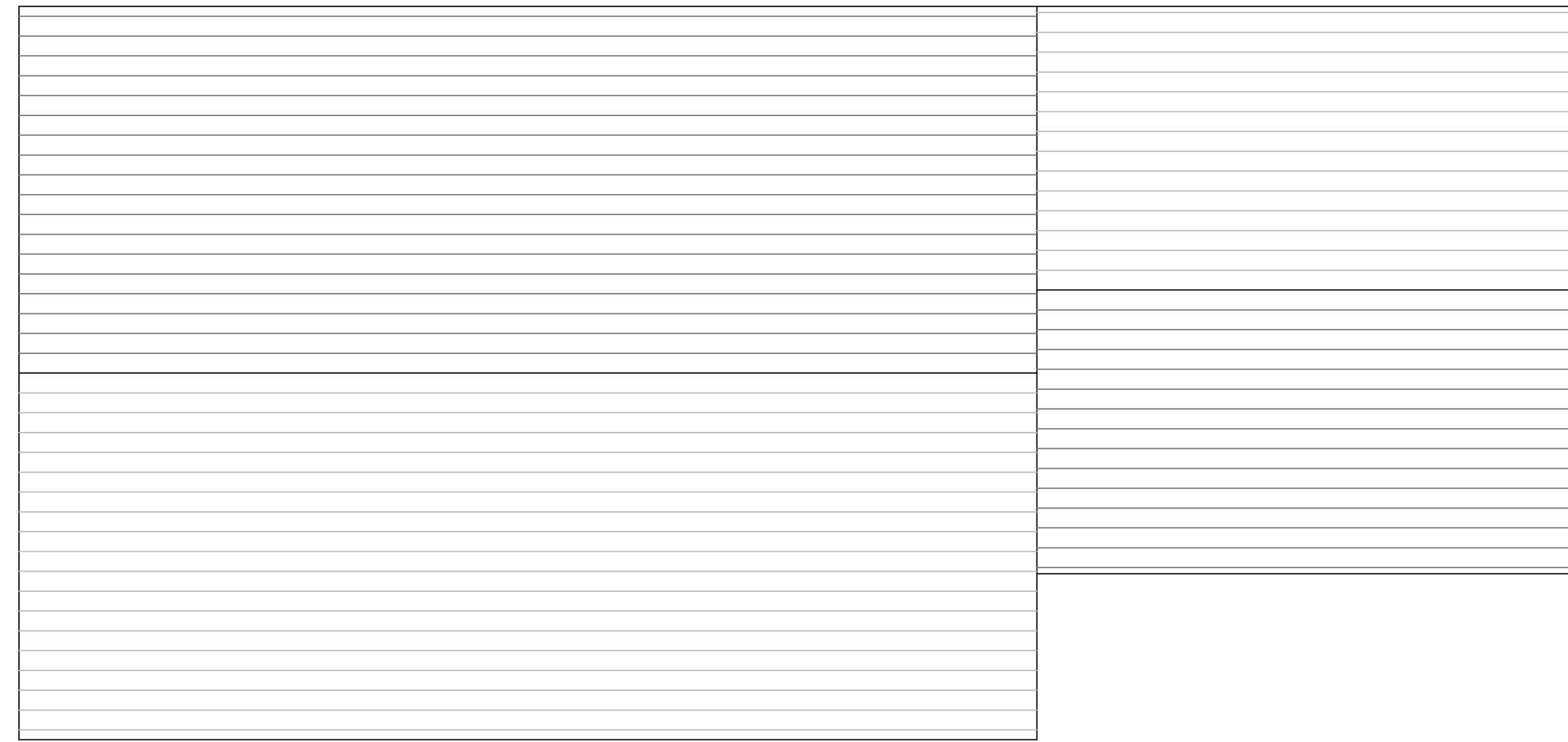
Existing roof Plan (1:50)