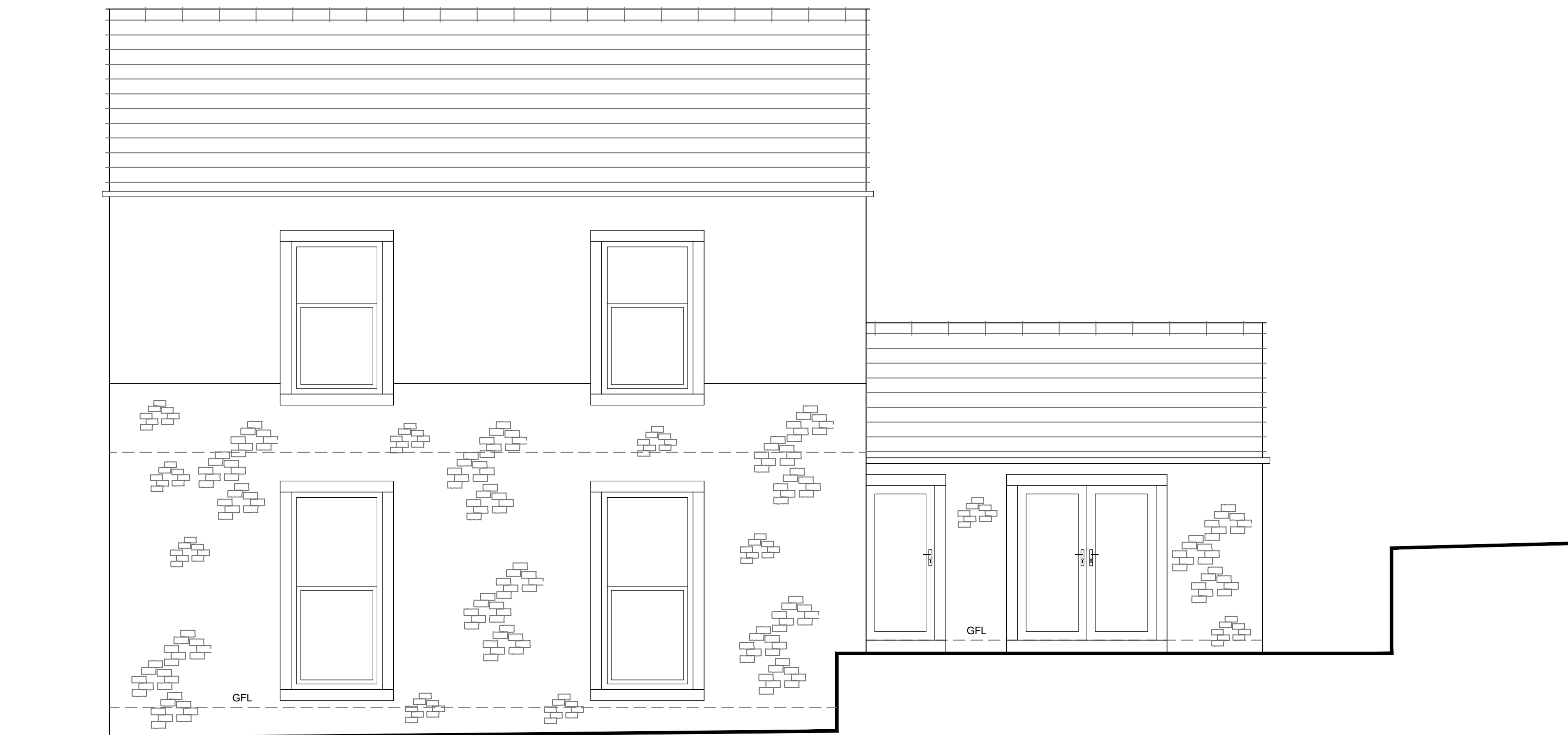
Existing Elevations (1:50)