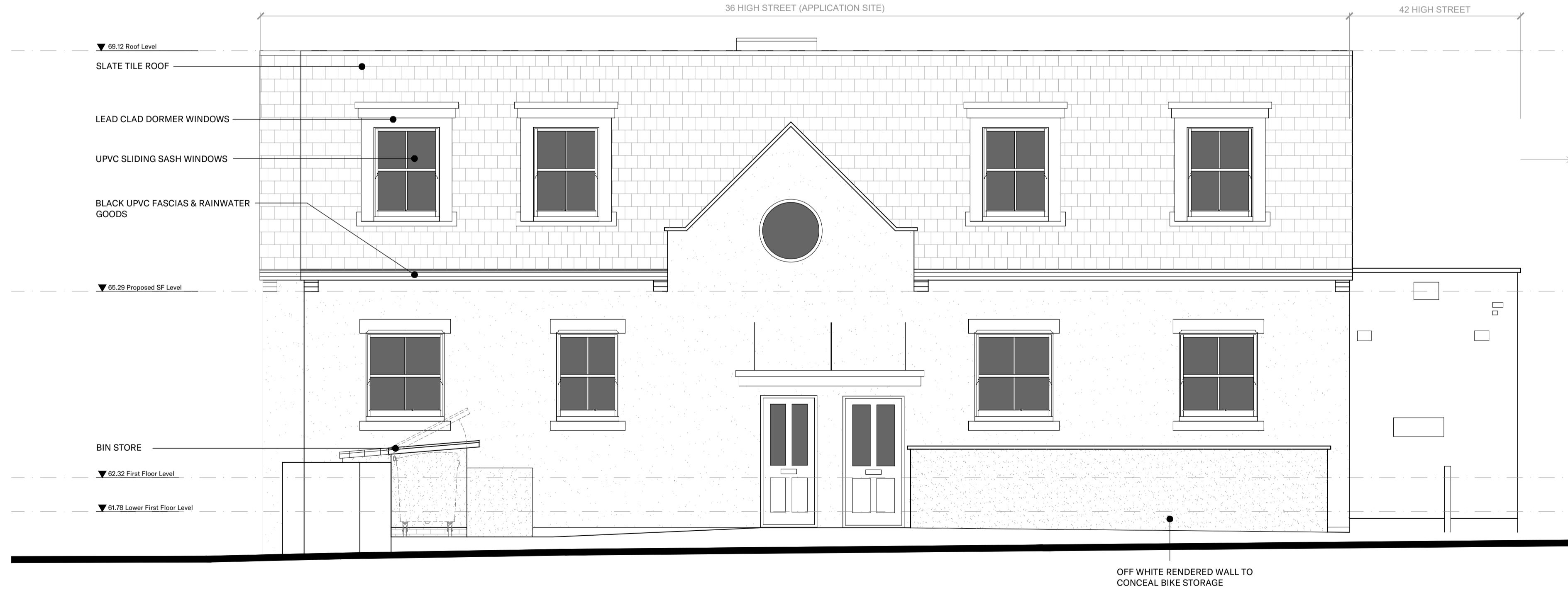
PROPOSED REAR ELEVATION - STREET VIEW SCALE 1:50@A1