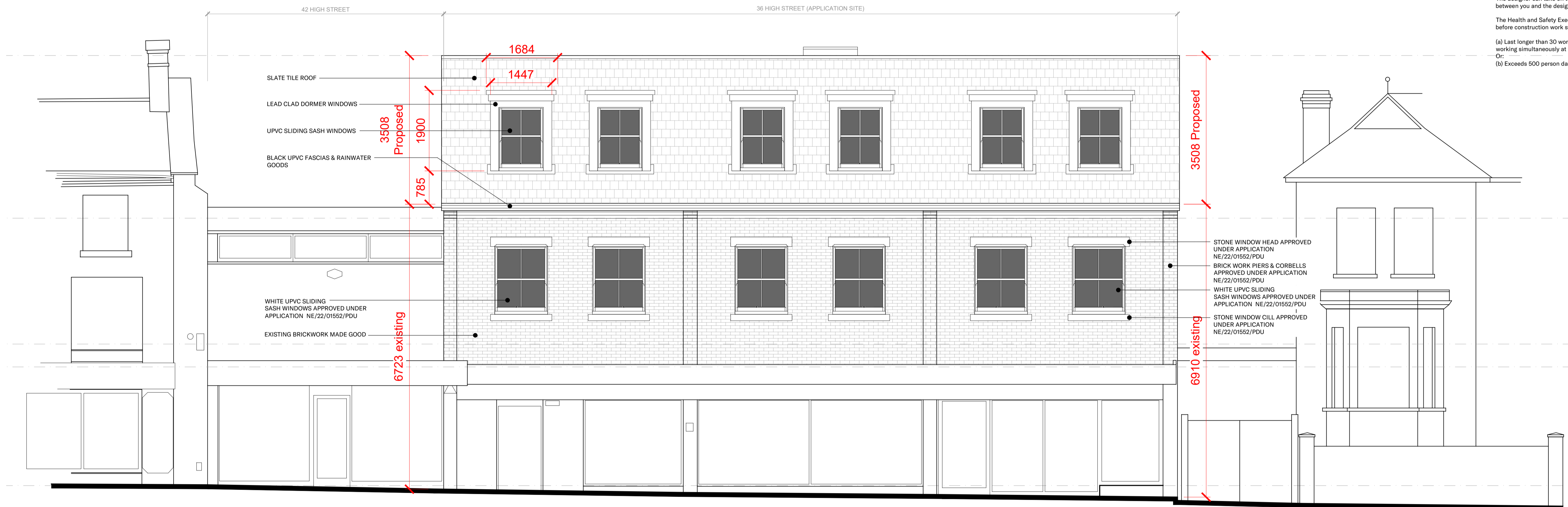
PROPOSED FRONT STREET FACING ELEVATION SCALE 1:50@A1