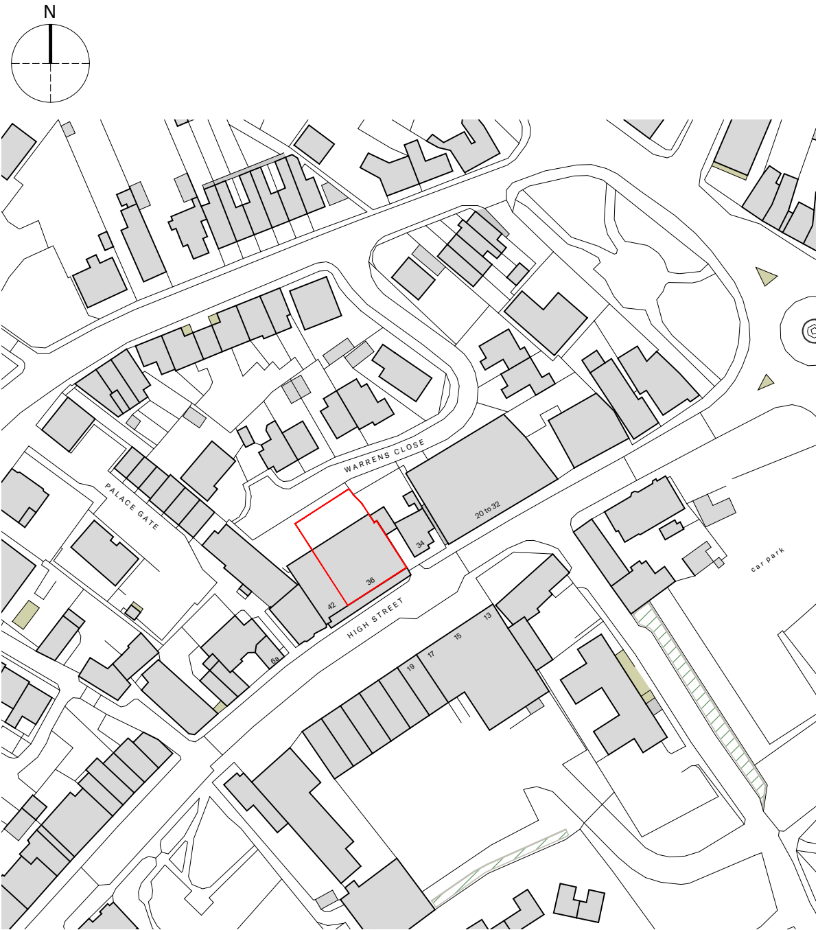
EXISTING SITE LOCATION PLAN