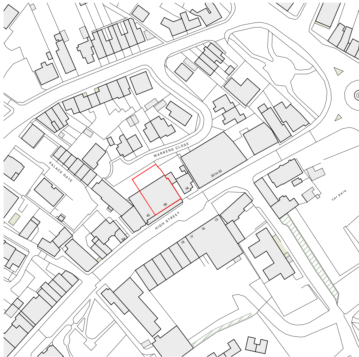
EXISTING SITE LOCATION PLAN