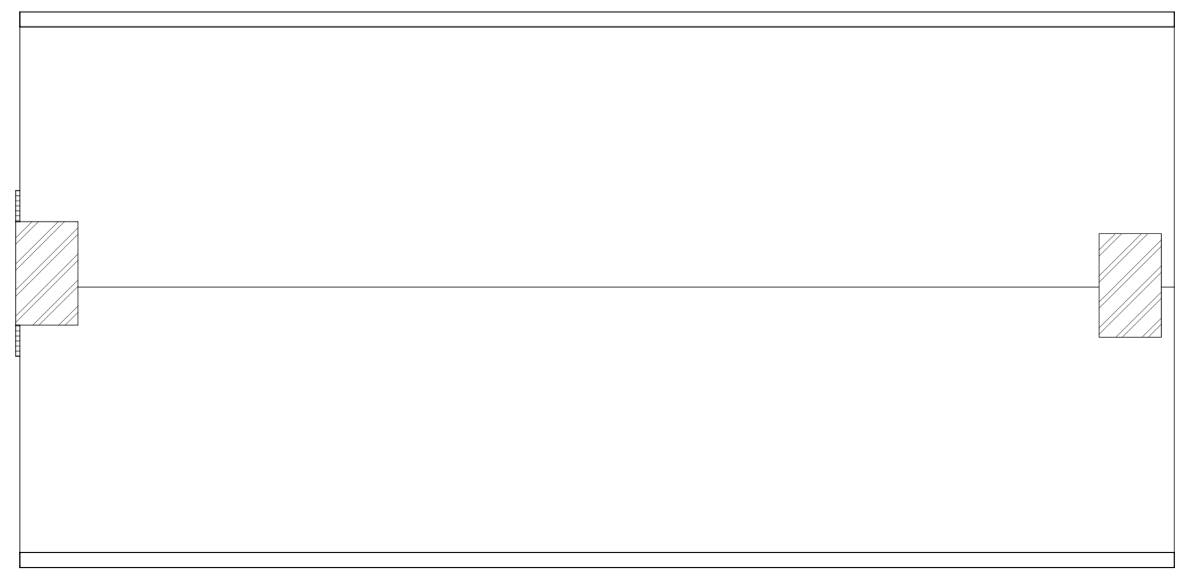
3 08.00.03 Roof Plan as Existing 1:50

SCALE 1 : 50 SCALE 1 : 1 0m 0.5m 1m 2m 3m 4m 5m 0m 10mm 20mm 40mm 60mm 80mm 100mm