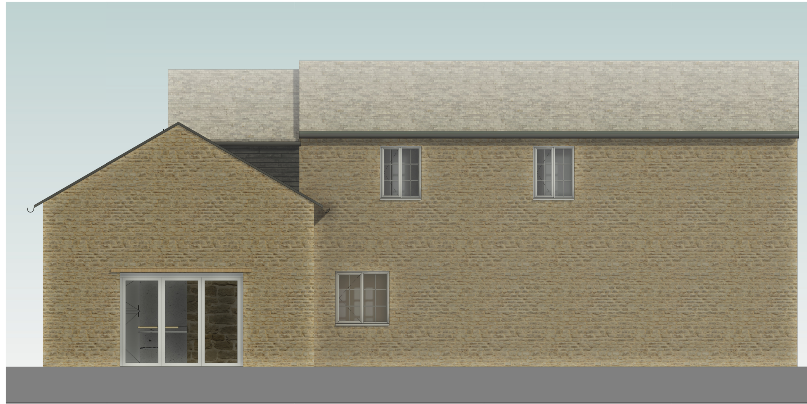
3 Rear Elevation as Proposed 08 70 02 1:50