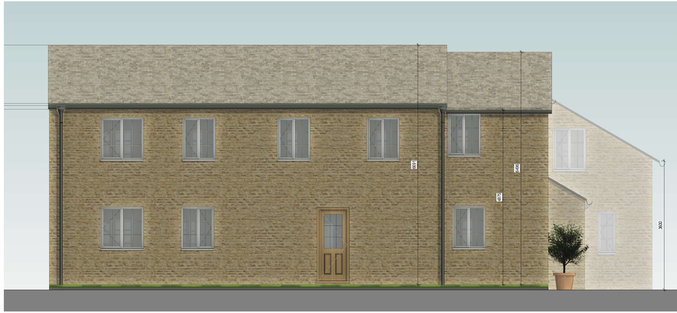
1 Front Elevation as Proposed 08 70 02 1:50

Copyright of this drawing is the property of SK-Architecture Ltd. It must not be reproduced or amended nor used in the execution of any works whether in conjunction with the proposed works for which it is prepared or otherwise without the express consent in writing of SK-Architecture Ltd.