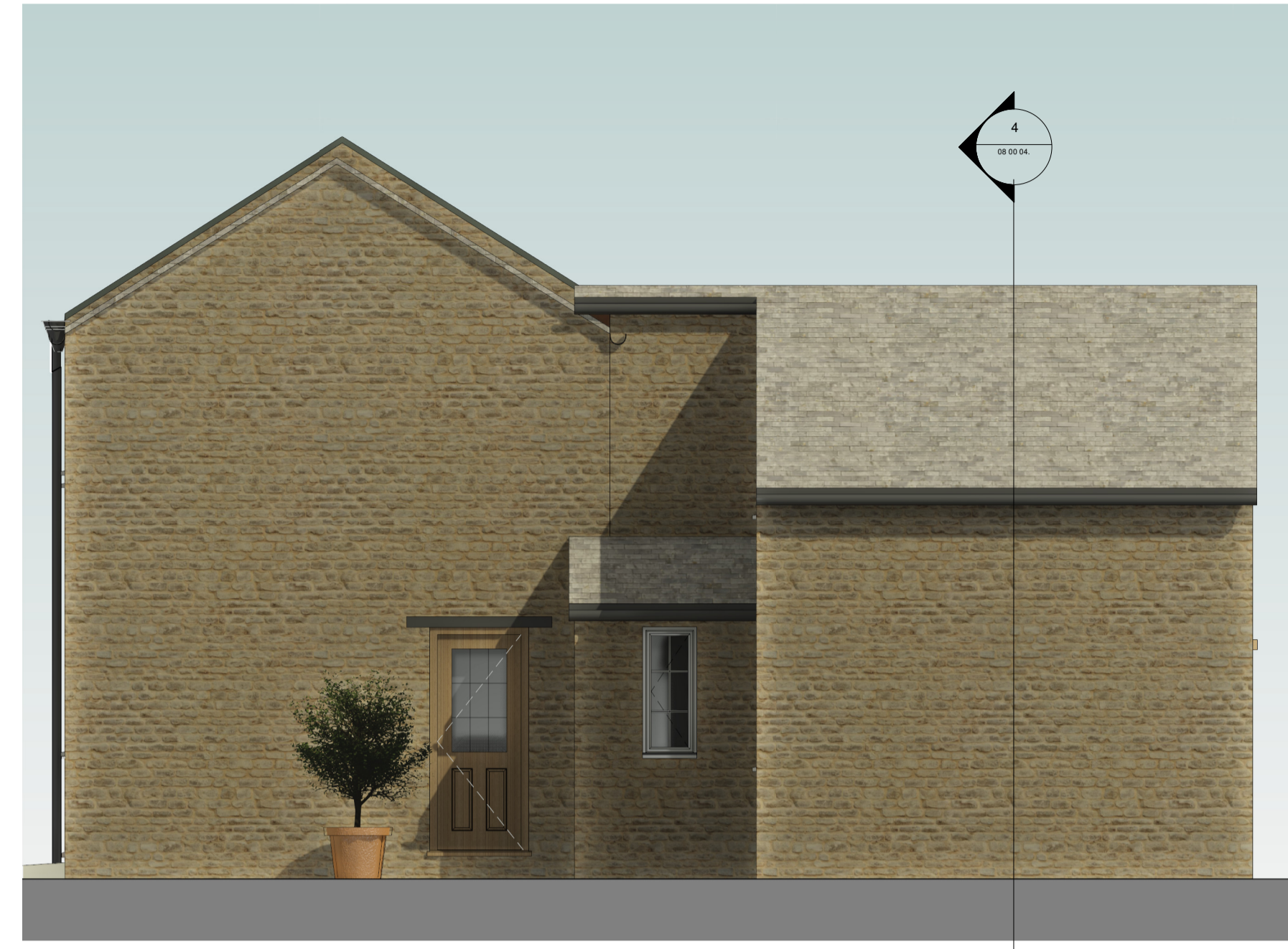
2 Side Elevation as Proposed 08 70 02 1:50