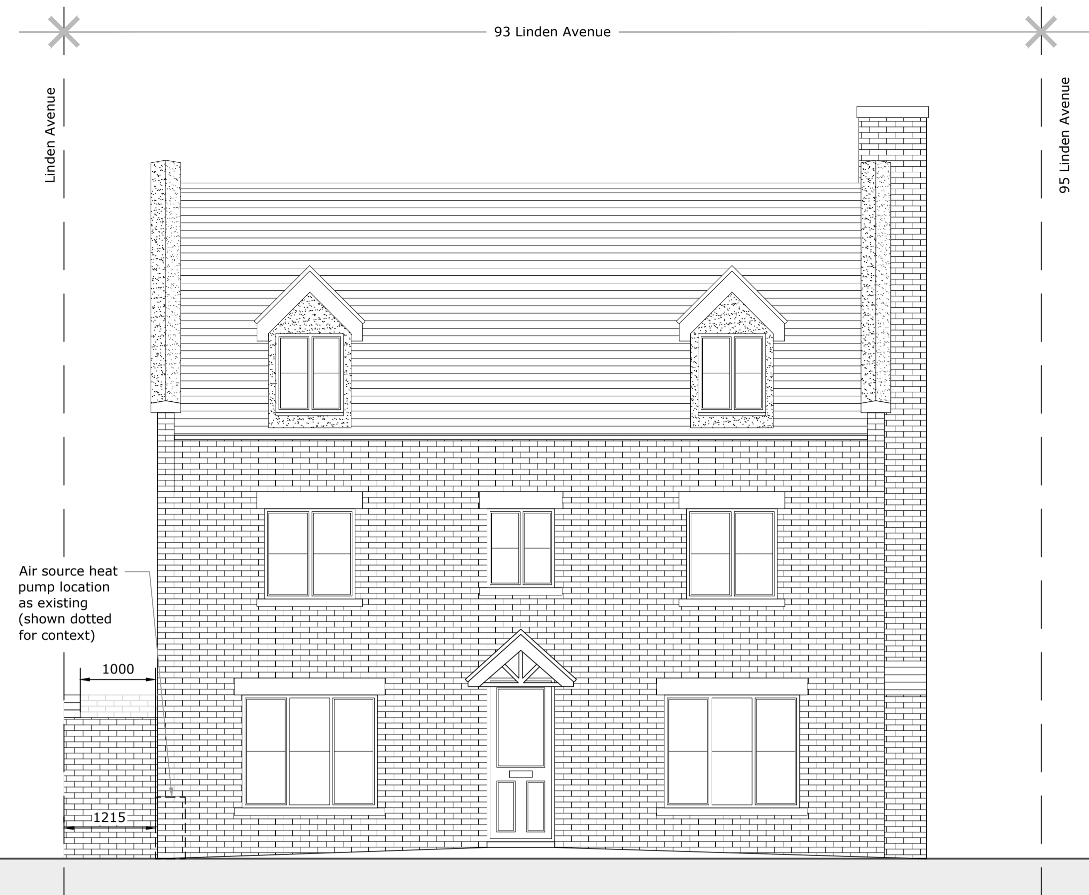
front elevation (north east facing) as existing 1:50