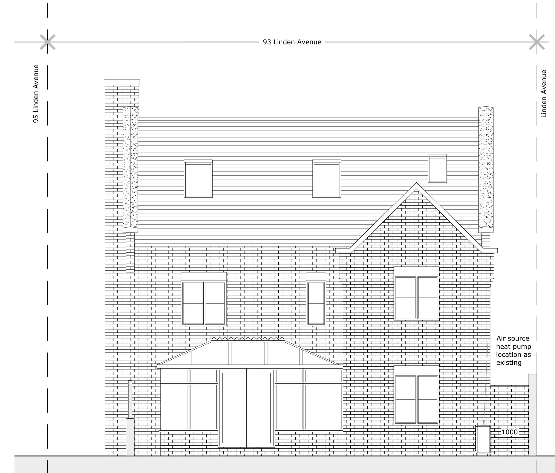
rear elevation (south west facing) as proposed 1:50