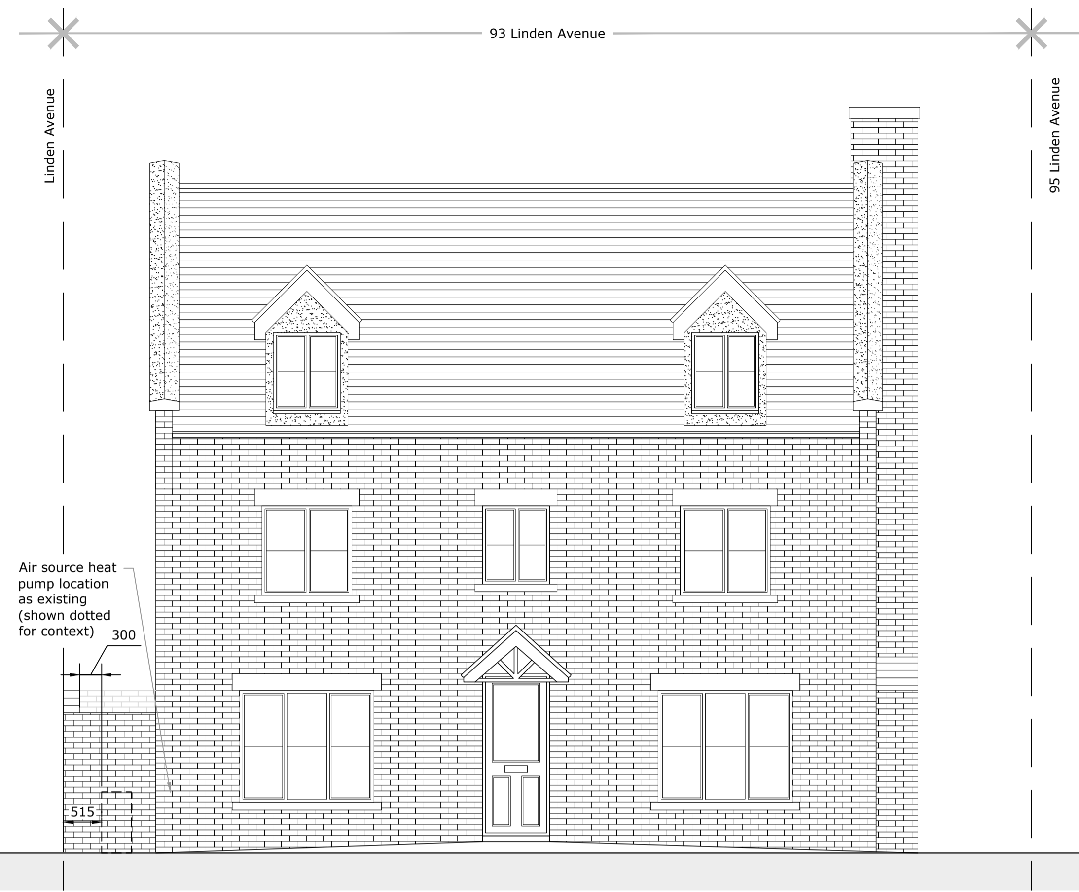
front elevation (north east facing) as proposed 1:50