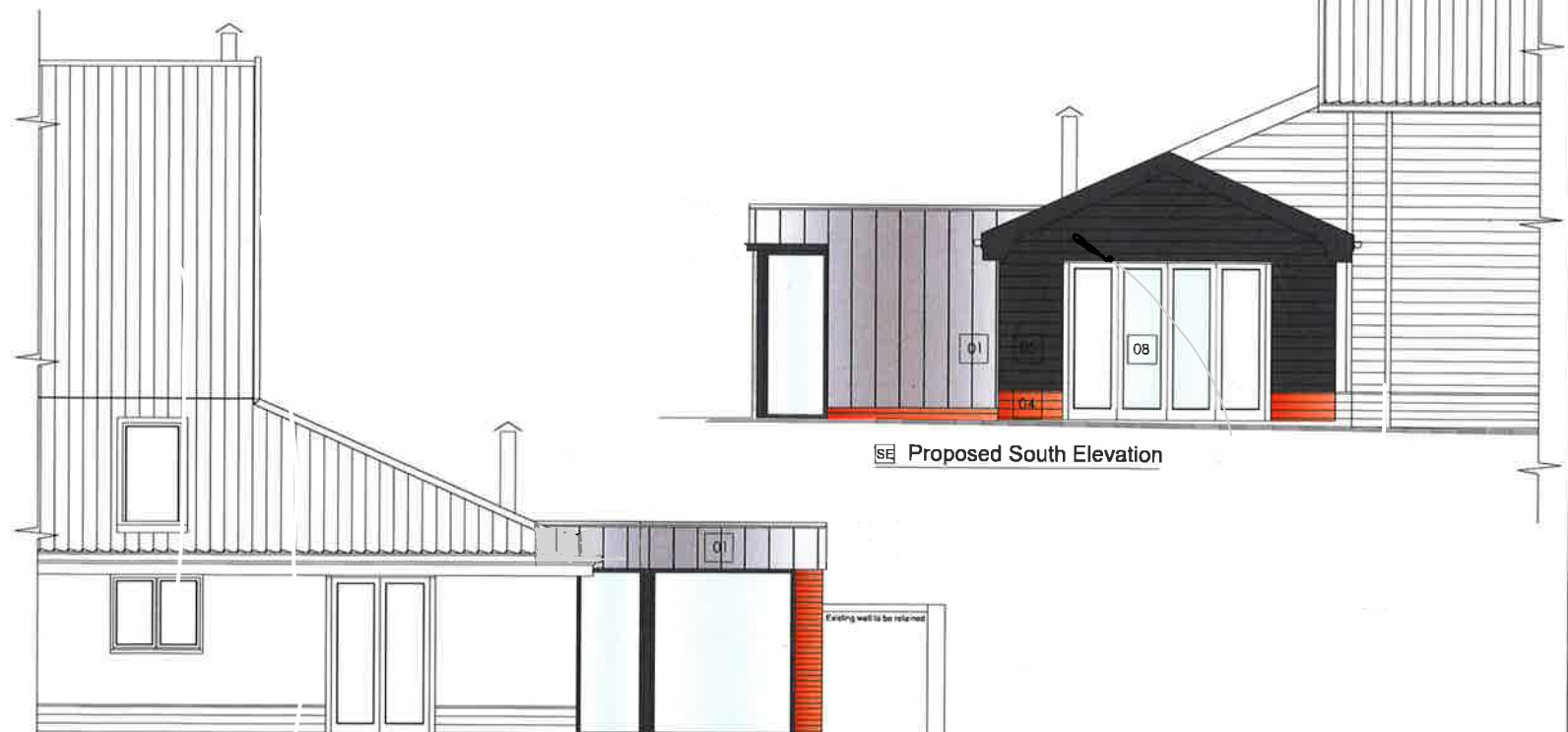
SE Proposed South Elevation