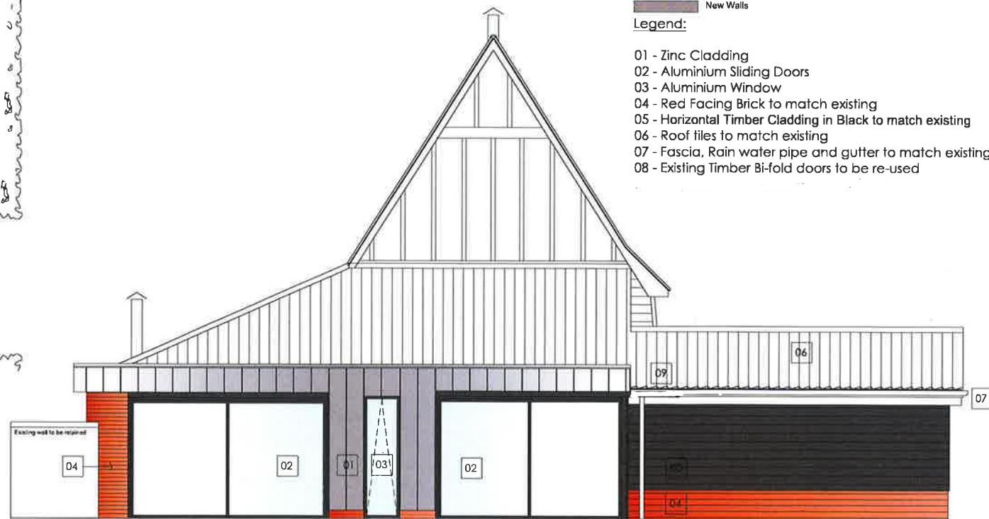
WE Proposed West Elevation