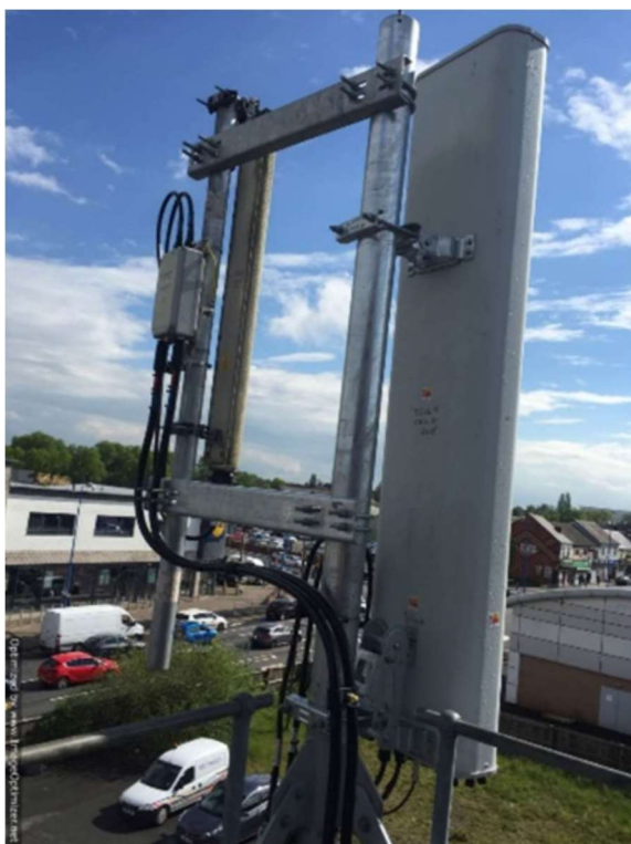
Source: Cellnex Blackheath Telephone Exchange – roof edge 5G antenna configuration

shadowing and antenna 'clipping' off the edge of the buildings and to allow the smart "tracking" features of the antennas.