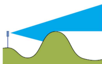
• Signal loss due to shadowing from terrain.

3.9 Clipping of signals is already an important operational factor reflected in planning guidance such as this diagram from Annex C of Planning Advice Note 62 in Scotland, but now more prevalent to 5G: