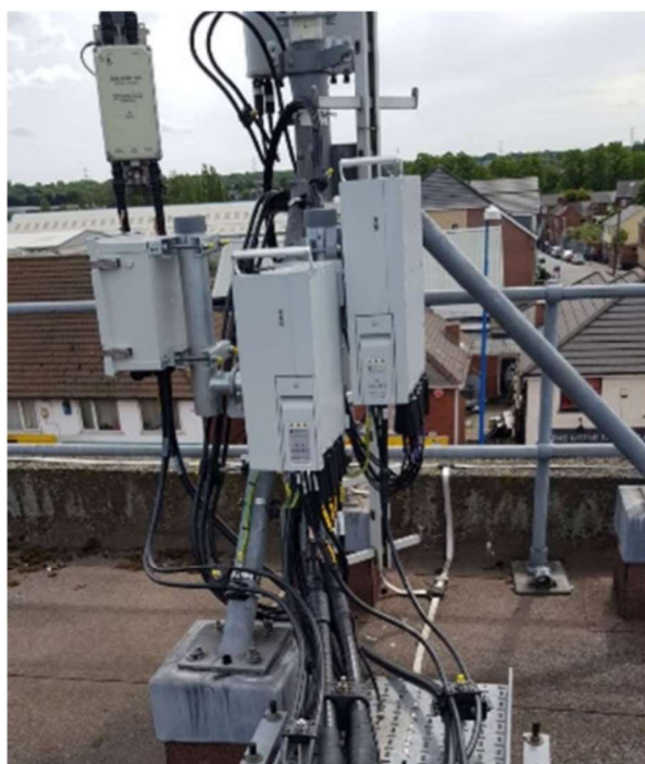
Source: Blackheath Telephone Exchange – 5G antenna support apparatus