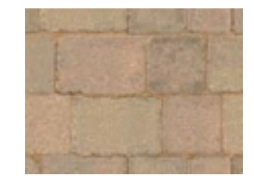
Monobloc type 1 -