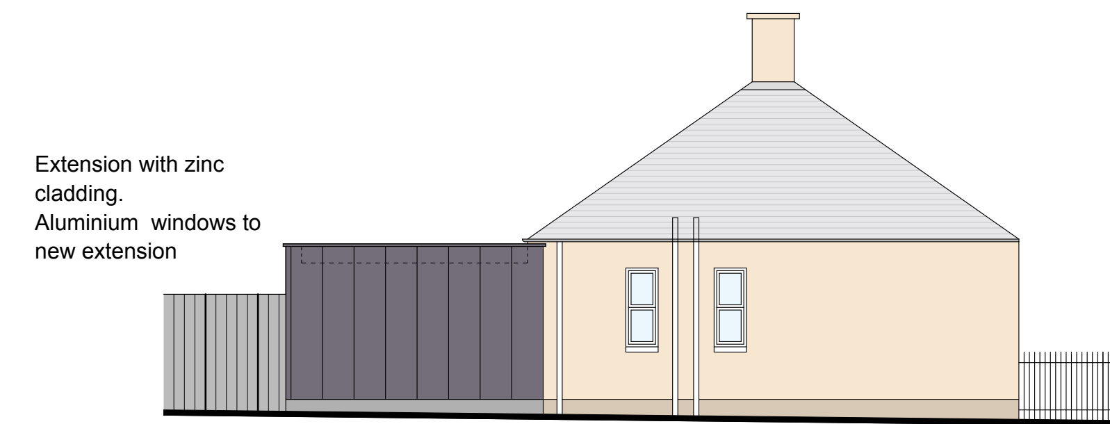
NORTH ELEVATION JANITOR'S HOUSE

New zinc clad entrance porch as detail drawing