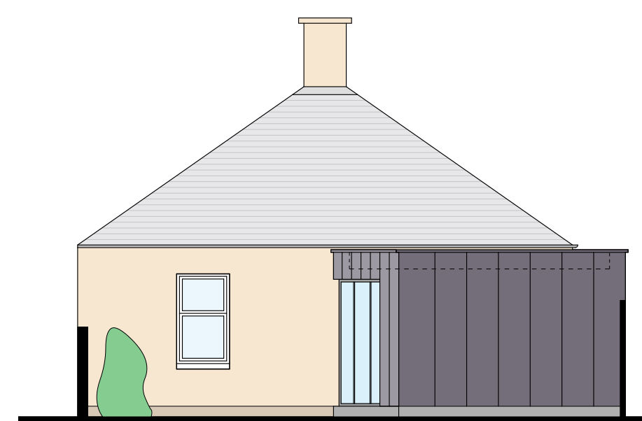
EAST ELEVATION JANITOR'S HOUSE

Extension with zinc cladding. Aluminium windows to new extension