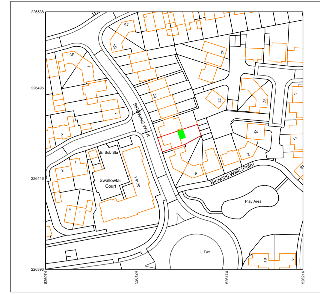
1:1250 Location Plan