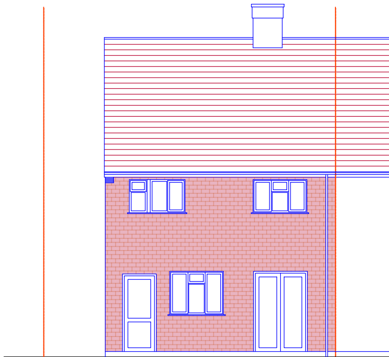
REAR ELEVATION: AS EXISTING