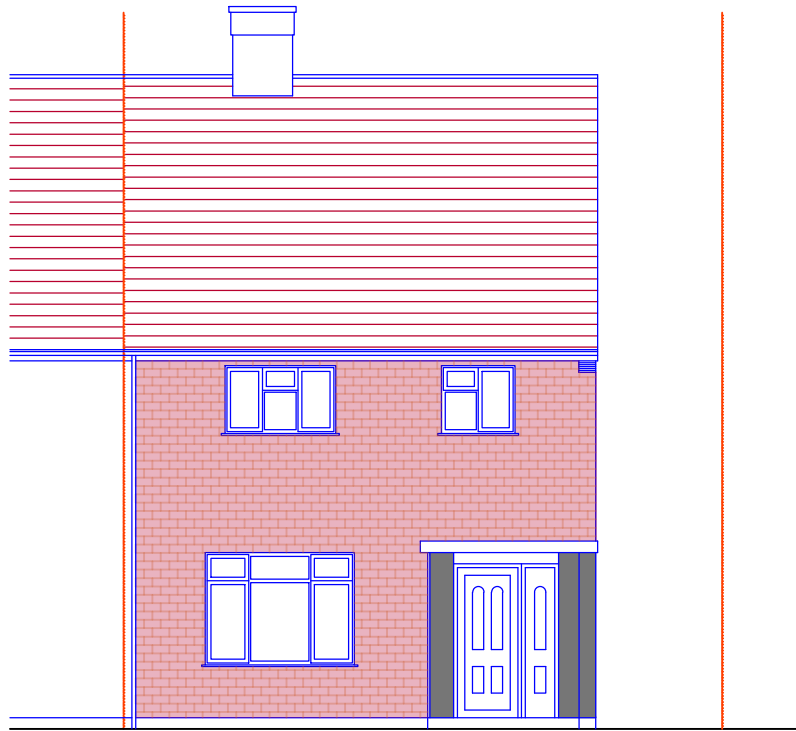
FRONT ELEVATION: AS EXISTING