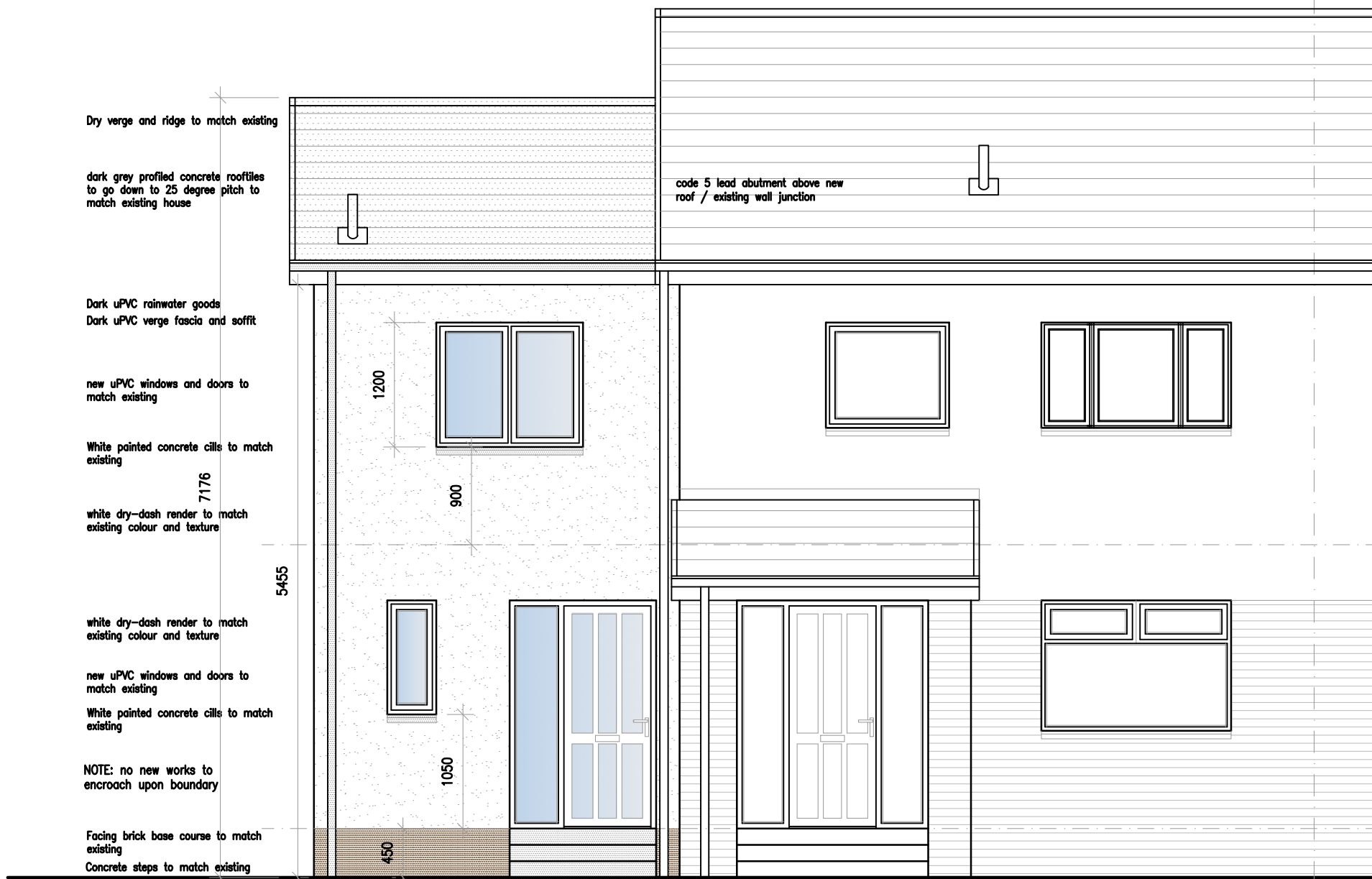
Proposed Front (east) Elevation (1:50)