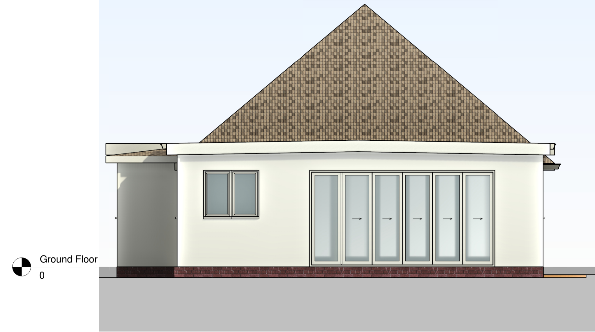
Rear Elevation 1 : 50