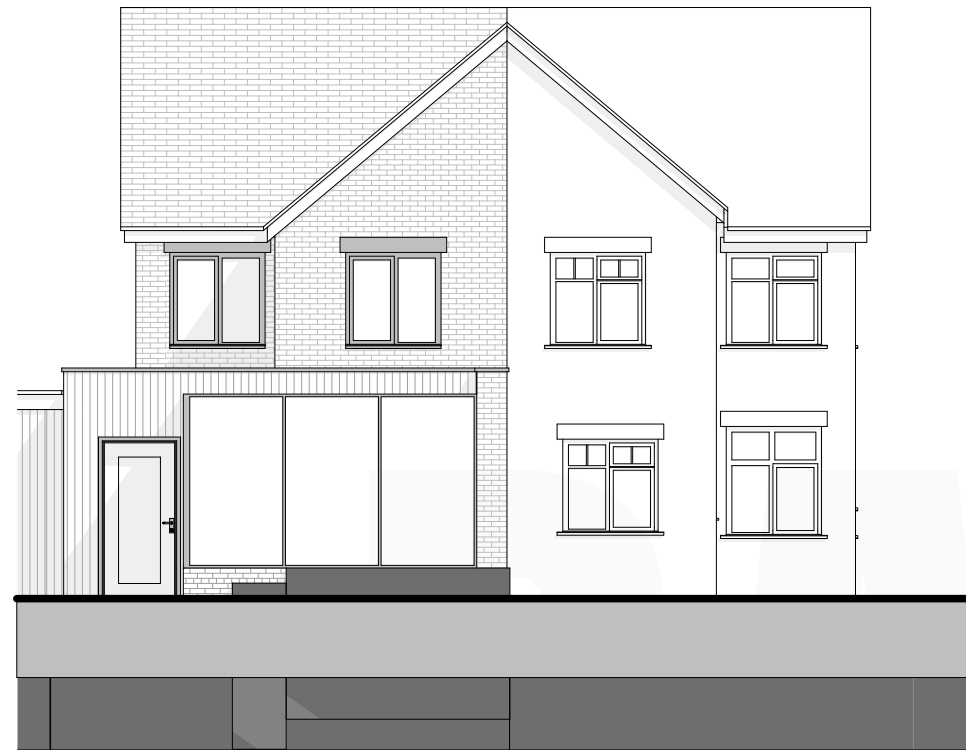
Proposed Rear Elevation 1:100

Offices: SHREWSBURY, CONWY, CHESTER Tel: 01743 236 400 | Tel: 01244 569 008 Email: HELLO@BASEARCHITECTURE.CO.UK Web: BASEARCHITECTURE.CO.UK