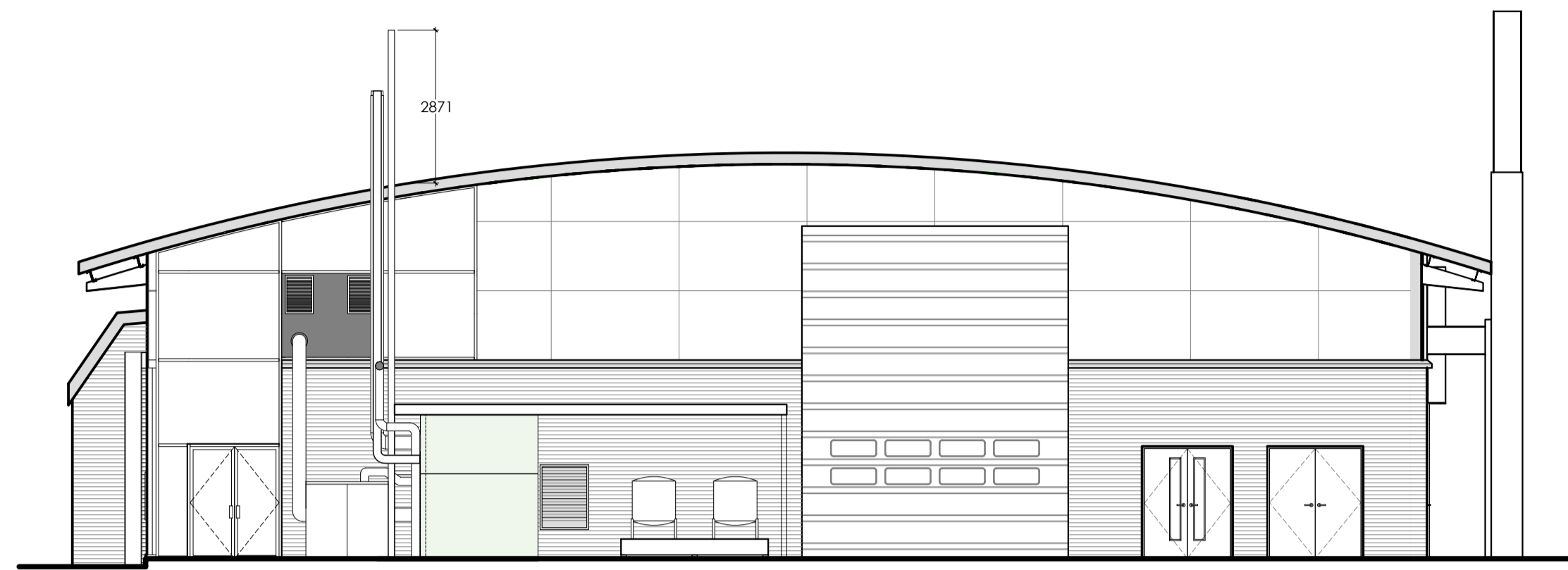
EXISTING SIDE (NORTH EAST) ELEVATION 1:100 @ A1