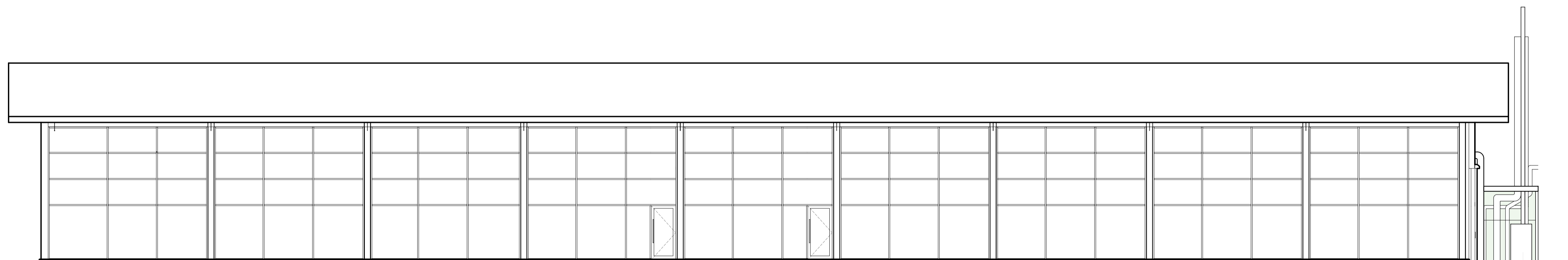
EXISTING REAR (SOUTH EAST) ELEVATION 1:100 @ A1

NOTES: 1. Do not scale off dimensions. 2. All dimensions, levels, sewer inverts to be checked on site by contractor before works commence. 3. All work to comply with the current Building Regulations & latest British Standard code of practice. 4. All work may be subject to revision on site. 5. This drawing may not be copied without prior permission.