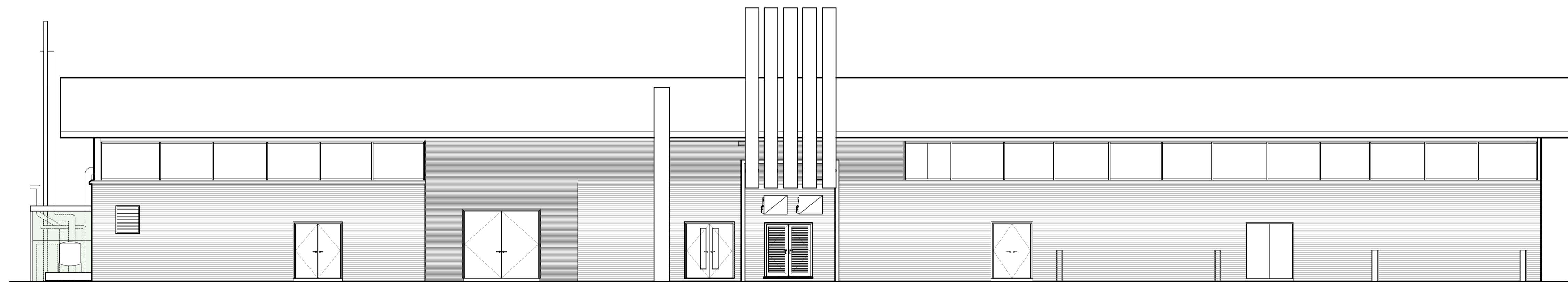
EXISTING FRONT (NORTH WEST) ELEVATION 1:100 @ A1