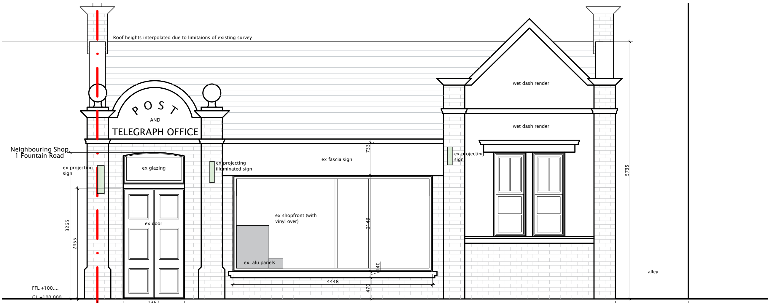
EXISTING FRONT (NORTH WEST) ELEVATION SCALE 1:50

notes: This drawing is for Building Warrant Purposes ONLY. Further Architectural or Engineering details may be required for construction and site works. This drawing to be read together with all other drawings and specifications. Any discrepancies to be reported immediately to the Architect. Only CONSTRUCTION or CONTRACT status drawings to be used for construction purposes. This drawing and its design are copyright property of HAB ARCHITECTURE LIMITED and is not to be reproduced without the permission of same. These drawings are to be read strictly in accordance with the Structural Engineer's drawings and specifications. ONLY SCALE FROM THESE DRAWINGS FOR PLANNING PERMISSION PURPOSES. If in doubt ASKI Refer your query back to the Architect or appropriate member of the design team.