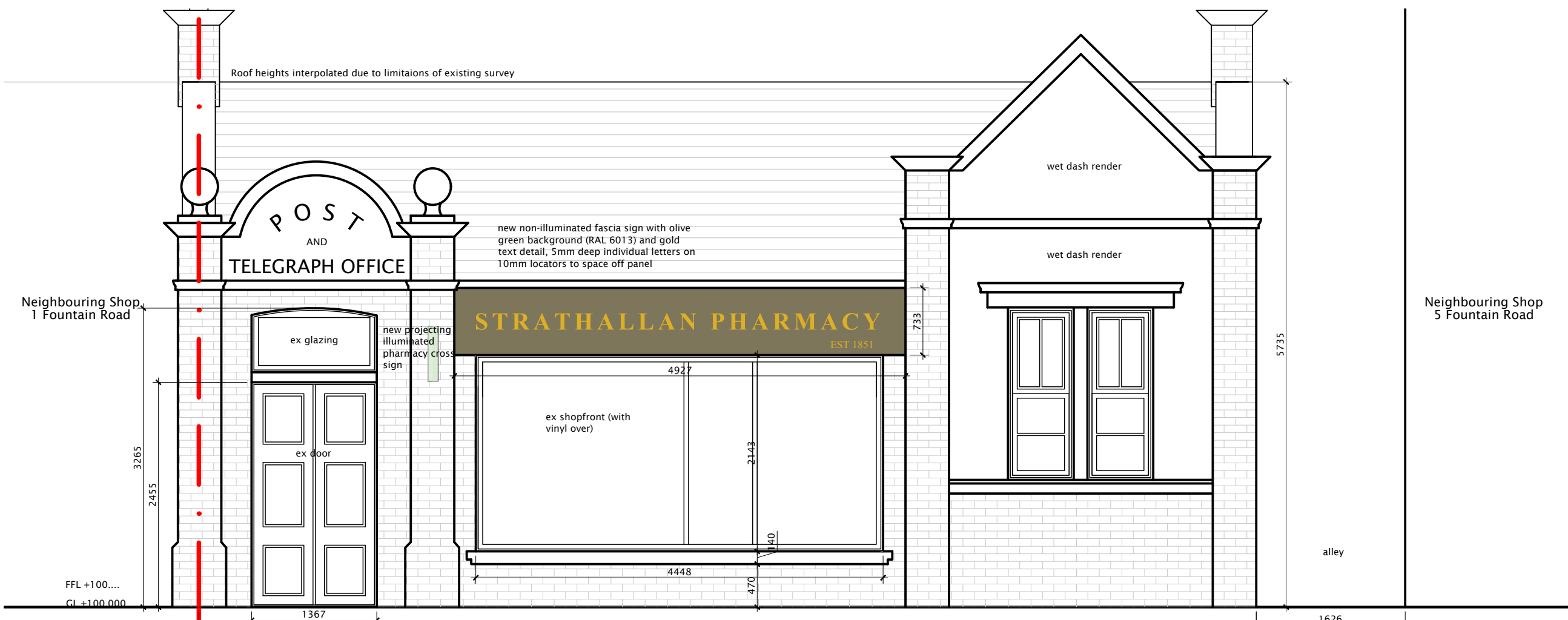
PROPOSED FRONT (NORTH WEST) ELEVATION SCALE 1:50